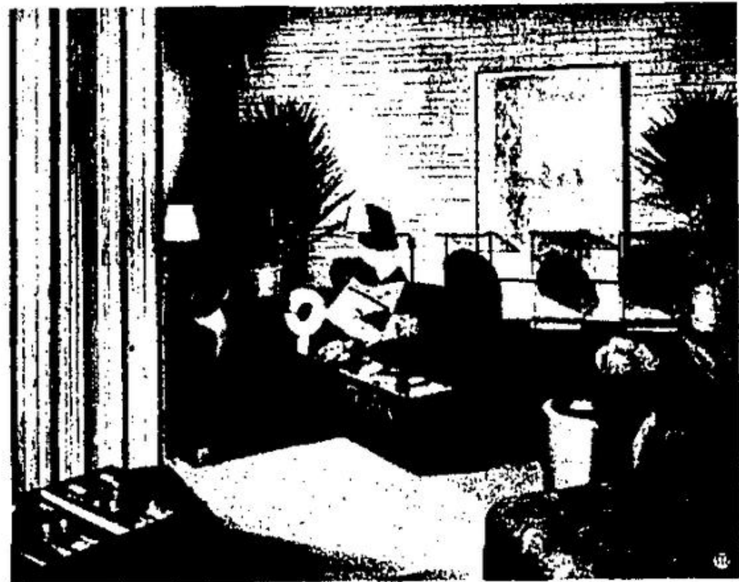
NEUTRAL, BUT SOPHISTICATED wallcovering creates a unifying backdrop for art objects collected from around the world. The blue and brown color scheme is indicative of today's color trends. The multi-functional sofa unit and T-shaped cocktail table are perfect space-savers for the apartment dweller. Imaginative touches include fabric-covered platform which doubles as a display area, a yarn wallcovering wrapped around a screen, and the Duralee wallcovering on the lampshade.

Wallcoverings are not only for walls — they make a room into a showcase!