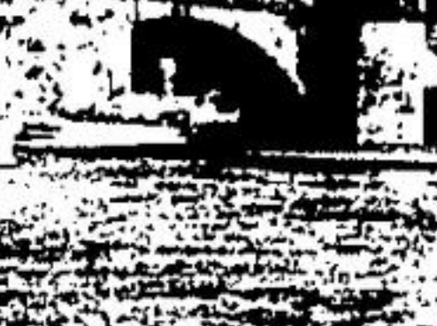
THE MASSIVE SCHLOSS HEIDELBERG, a German Renaissance castle nestled amid tightly nestled trees, is a confection in golden stone, towering above a fairytale town and dreamy river. The turreted Bridge Gate below boasts bell-shaped roofs that were added in the 18th century.

A train station in a European city is a marvel, an immense beehive of activity, that is a social center as well as a point of departure.