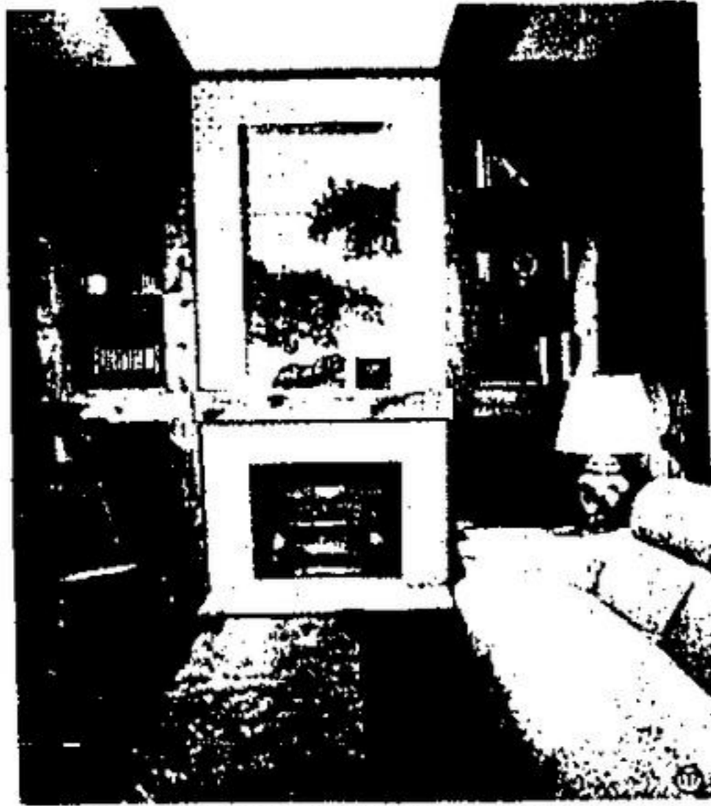
A DECORATE CERAMIC TILE. Wenzel's "Matisse" design, gives a den fireplace a bright new outlook. The tile wall above the mantel is designed to offer handsome displays of plants and/or favorite art objects, sculptured tile that casts intriguing light and shadow patterns are among the hundreds of other possibilities offered by today's fashion tile.

Ceramic mosaics set in a checkerboard pattern or a