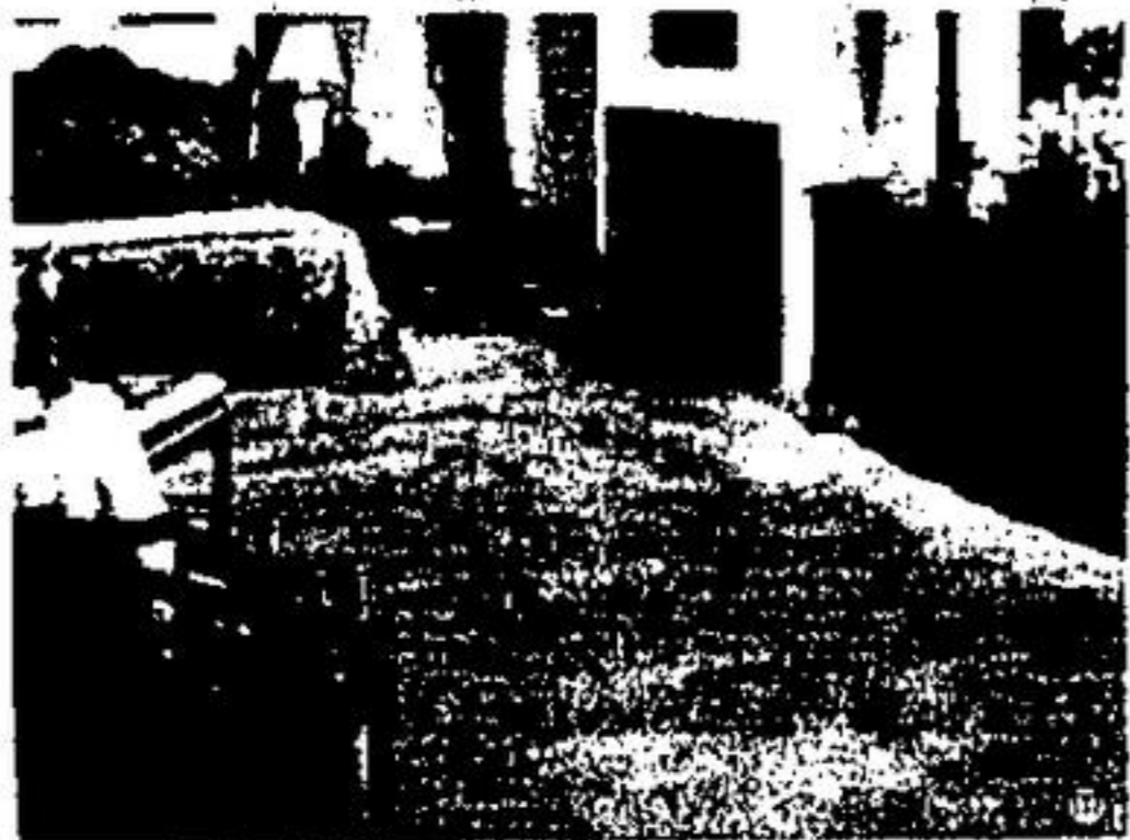
THIS MASTER BEDROOM occupied by two adults needs a substantial carpet, such as Impetuous by Bigelow. Performance Rated III for general traffic, the lush saxony is a lovely foil to the soft floral theme of the room.

How do you judge carpet performance? The makers of Bigelow carpets have come up with a unique new Mark of Performance™ rating system that will allow you to buy the carpet that best suits your needs. The Mark of Performance™ assigns relative performance ratings to all