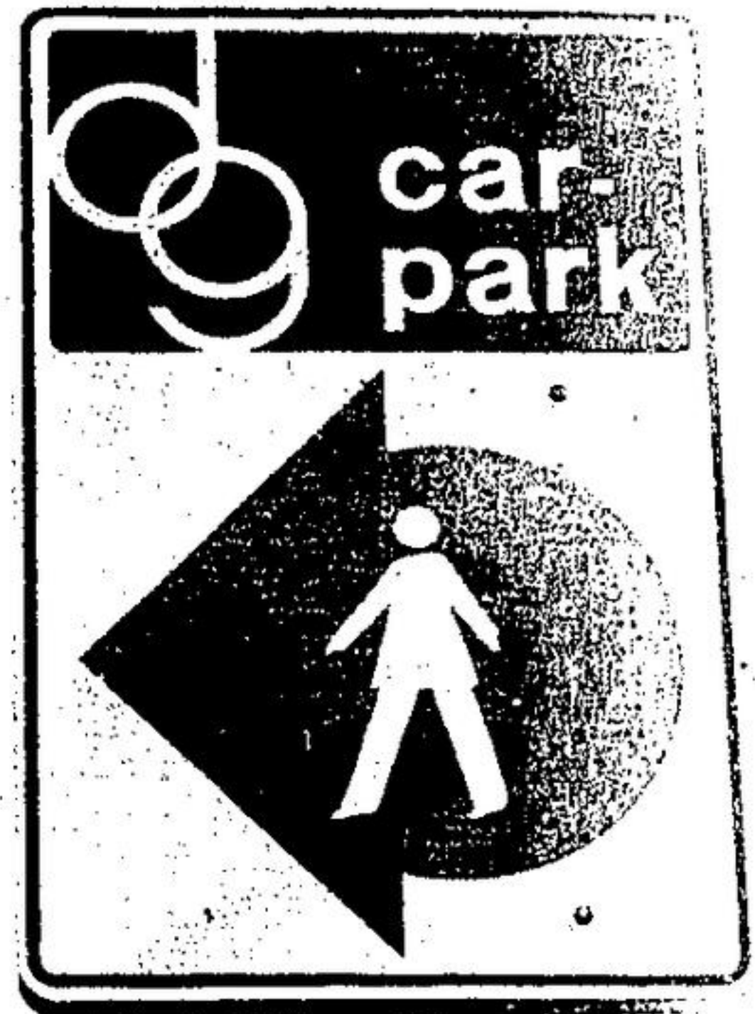
This sign is one of several which were recently erected in the downtown area of Georgetown as part of the Georgetown BIA's campaign to beautify the area and make it easier and more pleasant to shop downtown. Signs indicate the location of the municipal parking lots and walkways from the street to the parking lots. The signs and other improvements are funded by a special tax collected from businessmen within the downtown area.

The Baha'is of Halton Hills and their friends were invited by the Milton Baha'i Community to celebrate this event with a pot luck dinner and an evening of fun and entertainment at the Boyne Community Centre in Milton.