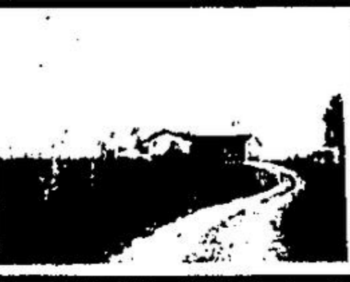
DO YOUR OWN THING Terrific view from modern 4 level sidesplit situated in scenic Terra Cotta area. Plus 27 pretty wild acres including sugar maple bush. A real place to do your own thing for below $100,000.00. Call Reg Cooper 877-0173.