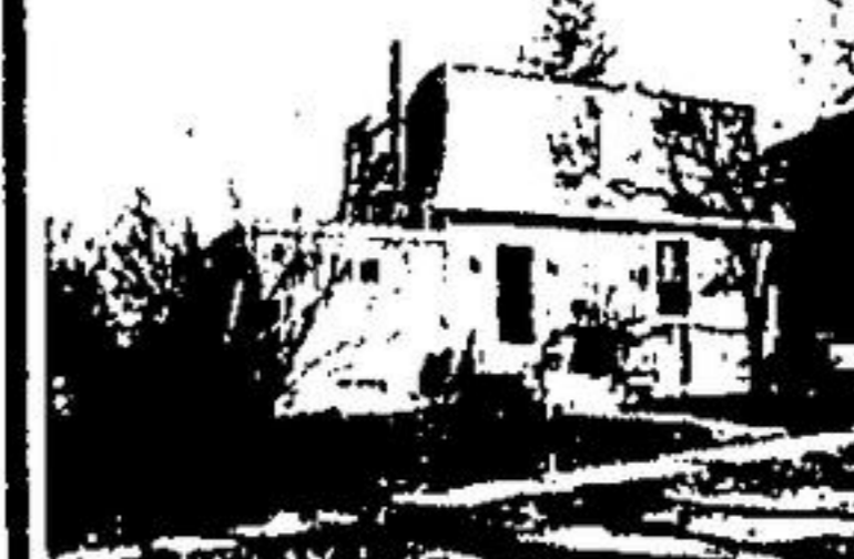
NEW LISTING ANOTHER GEORGETOWN DOLL HOUSE Very conveniently located - remodeled super large bright modern kitchen, 2 full baths. Be first to see it - call Rudy Cadieux 877-8244, 453-8454.