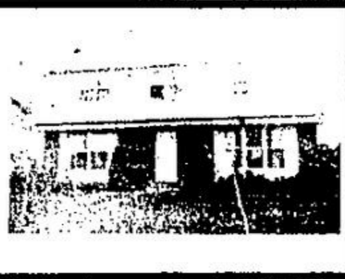
RECIPE FOR GOOD LIVING Combine the kitchen with dinette plus dining room for dining pleasure. Mix 5 upstairs bedrooms with 5 piece bathroom ensuite to master. Add nice family room and franklin fireplace. Put in large family and let stand on excellent lot. Call George for the rest of the recipe. 877-0173.