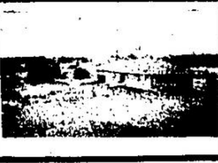
SPACIOUS BUNGALOW Now on - never for this scenic 100 acre farm in Georgetown area. Spacious modern brick bungalow with 2 car garage plus good bank barn. No commuting problem here plus a definite need to sell. Call Reg Cooper 877-0173.