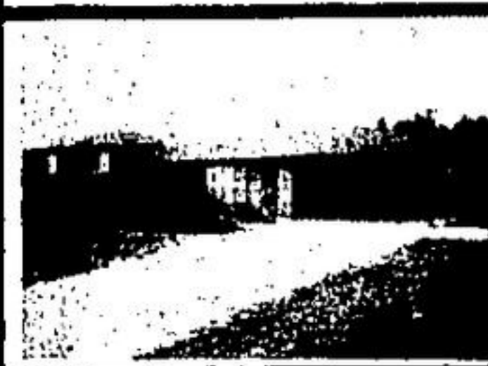
EASY COMMUTING Straight up Dixie, and in the country on 1/2 acre lot. 3 bedroom sidesplit with ground floor family room boasting stone fireplace and walkout. Size of living room will amaze you and the kitchen is a pleasure. Call Bob Ollivier for the extras 877-0173.