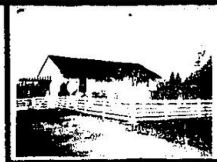
NEW LISTING Are you looking for a country property at a price you can afford and on the outskirts of town? A lot of tender loving care has gone into this 3 bedroom bungalow situated on just over an acre. Call Susan Carrier for more details. 877-0173.