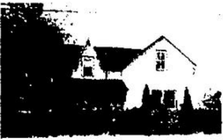
3 APARTMENT HANDYMAN'S SPECIAL You can live rent free in one and let the other two apartments help you pay off the mortgage. Let us show you how! Asking price $55,900.