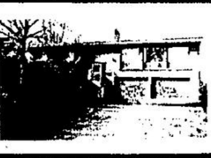
GLEN WILLIAMS Quality built custom home with 1500 sq. ft. of living space on 3/4 acres, beautifully landscaped, and conveniently located to schools, shopping and recreation. Just reduced $83,900. See it with Trudy Simmons 877-0173.