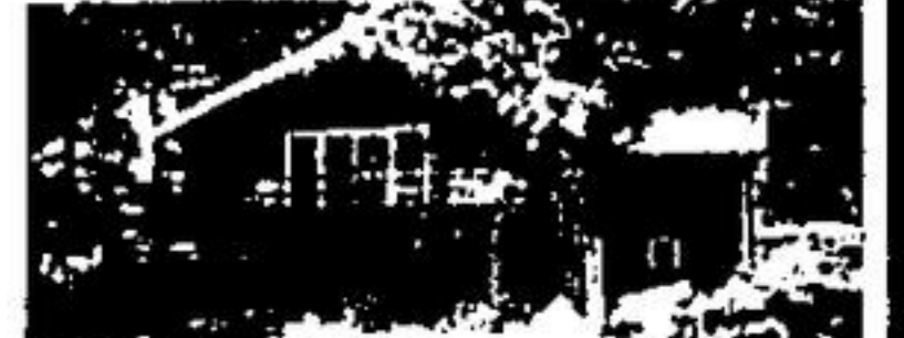
COUNTRY PROPERTY IS IN DEMAND MORE THAN EVER DON'T BE DISAPPOINTED See this "dream home" now! Excellent Georgetown location! Super 2 1/2 acre wooded, landscaped lot. If you believe you deserve something special - you owe it to yourself to see this fantastic buy now. Call Rudy Cadieux 877-8244, 453-8454.