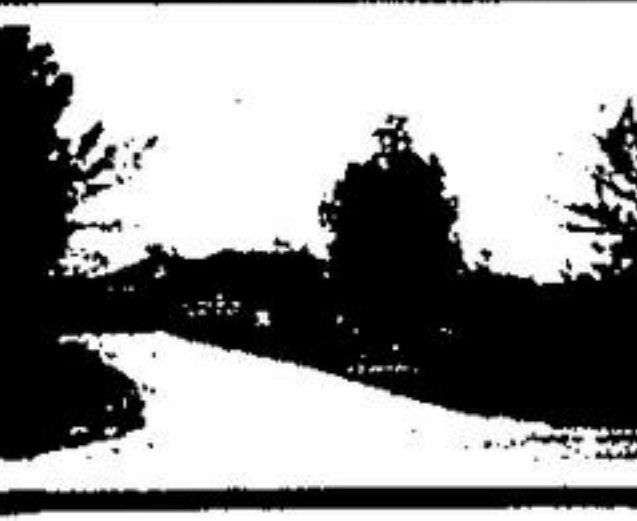
BIGGEST APPLES AROUND This 3 bedroom brick bungalow is truly a commuters delight, featuring large rooms and a detached garage. Located for easy access to the 401 on a 5 acre lot that includes a mature orchard with Big apples. Country atmosphere yet close. Let Mike show you just where. 877-0173.