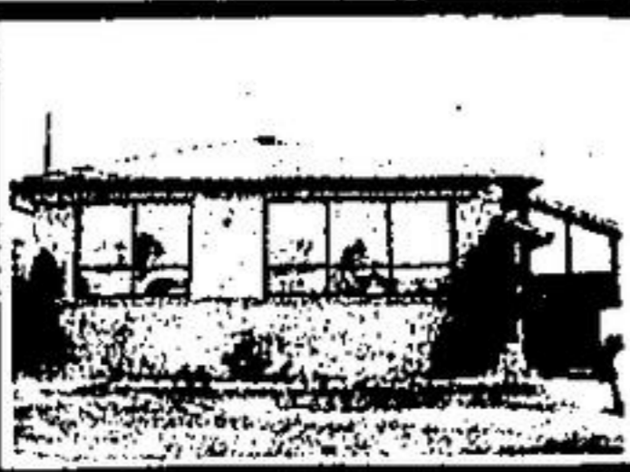
GEORGETOWN Solid brick detached bungalow, 3 bedrooms, living room and dining room nicely decorated. In move in condition, plus a finished rec room, playroom and wine cellar. A double garage completes the picture. Listed in low 60's. Try your offer, call Tillie 877-0173.