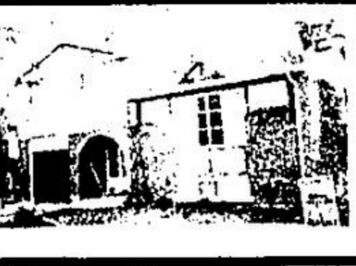
EXCEPTIONAL VALUE Where else can you get a separate family room with brick fireplace, 10x15 living room, 9x7 kitchen and 3 large bedrooms. Lots more space for rec room. Check it out with Bob Ollivier 877-0173.