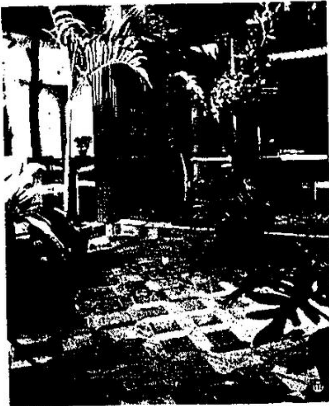
THE ATRIUM IS ENJOYING A REVIVAL, and ceramic tile, impervious to moisture and so fuss-free, is the natural flooring medium. Here, Summitville's Strata tile, VERY reminiscent of elegant parquet, but without the cumbersome maintenance aspects of its look-alike, paves the floor beautifully.

you've already discovered that greenery thrives in the bath. So why not surround your tub with a tiled enclosure that'll give you extra-wide ledges on which to place the plants?