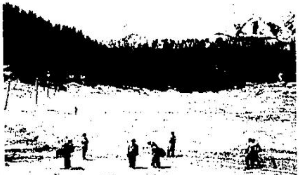
A golf course in Gulmarg at the foot of the Himalayas.