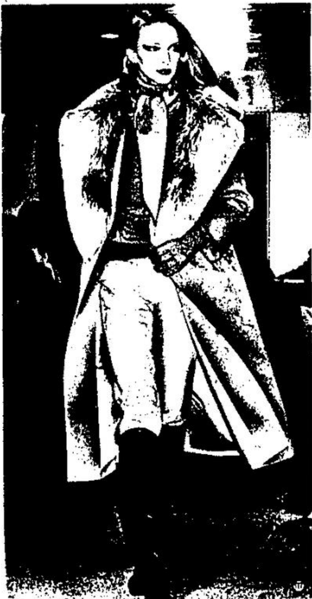
FOR THE ULTRA-CHIC, the Ultraseal coat costume—trimmed in beige fox from the master, Halston.