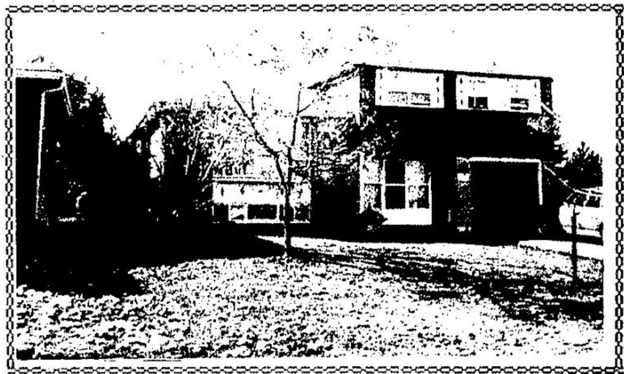
Just one of the many properties advertised in this special Real Estate Section. SEE PAGE 28