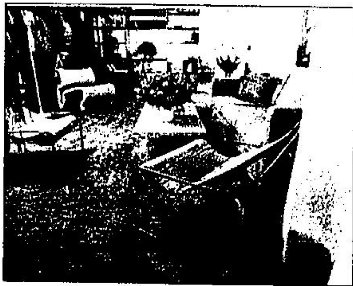
Sliding glass doors from an extra large living room open onto a 90 square foot private balcony to make it a delightful summertime extension to your home. 2 bedroom model illustrated.