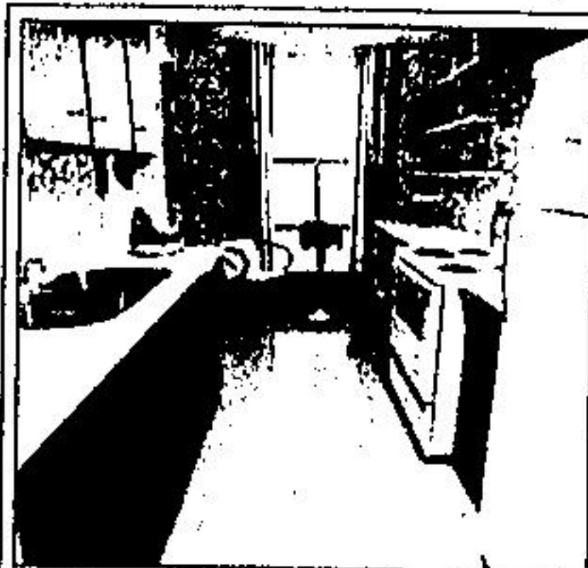
Floor to ceiling windows in the breakfast nook make it a great place to enjoy family meals. And it's so handy. You'll also appreciate the easy-care finish on the kitchen cabinets and the convenience of double stainless steel sinks.