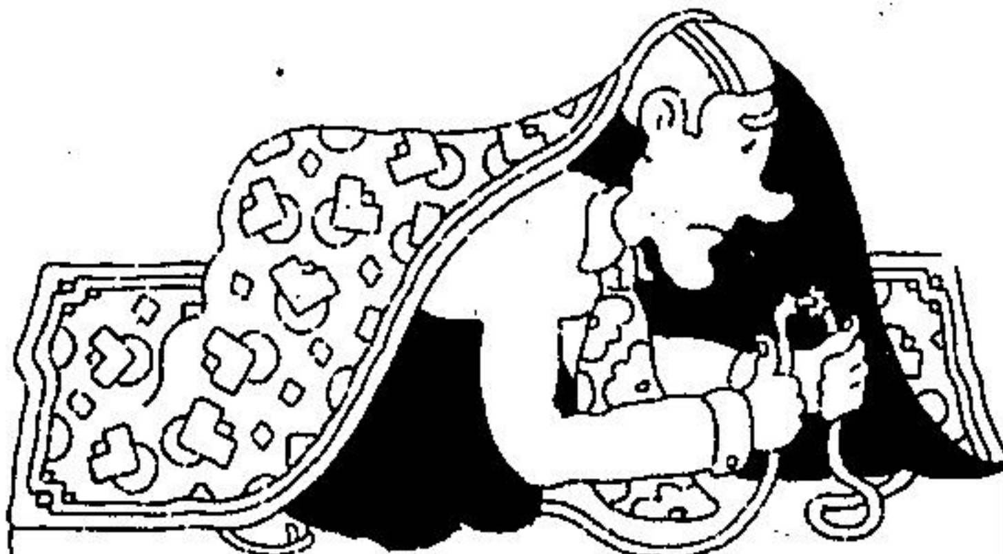
DON'T RUN ELECTRIC WIRES UNDER THE RUG. PEOPLE WALKING ON THEM WILL SOON BREAK THEM OPEN AND THE HOT ELECTRICITY INSIDE WILL CAUSE A FIRE. KEEP WIRES WHERE YOU CAN SEE THEM.