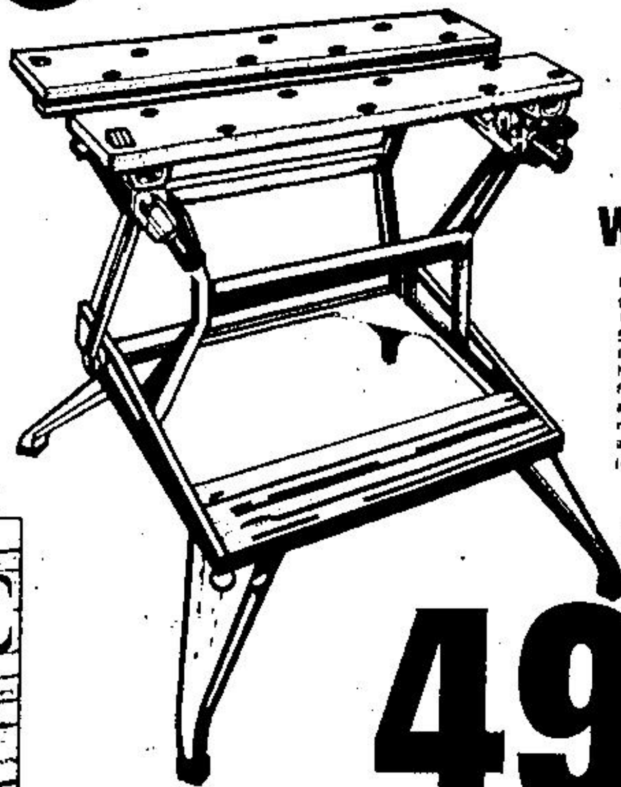
BLACK & DECKER DUAL HEIGHT WORKMATE

Fold away portable work centre, giant vise and saw horse all in one 12" vising capacity using pegs 5 3/4" opening between jaws improved high impact plastic handles. New stronger steel "H" frame. Non-slip feet, one adjustable foot for perfect balance. And now two working heights - 31 7/8" and 23 3/4". Full 29" wide vise jaws. 1080-314-1