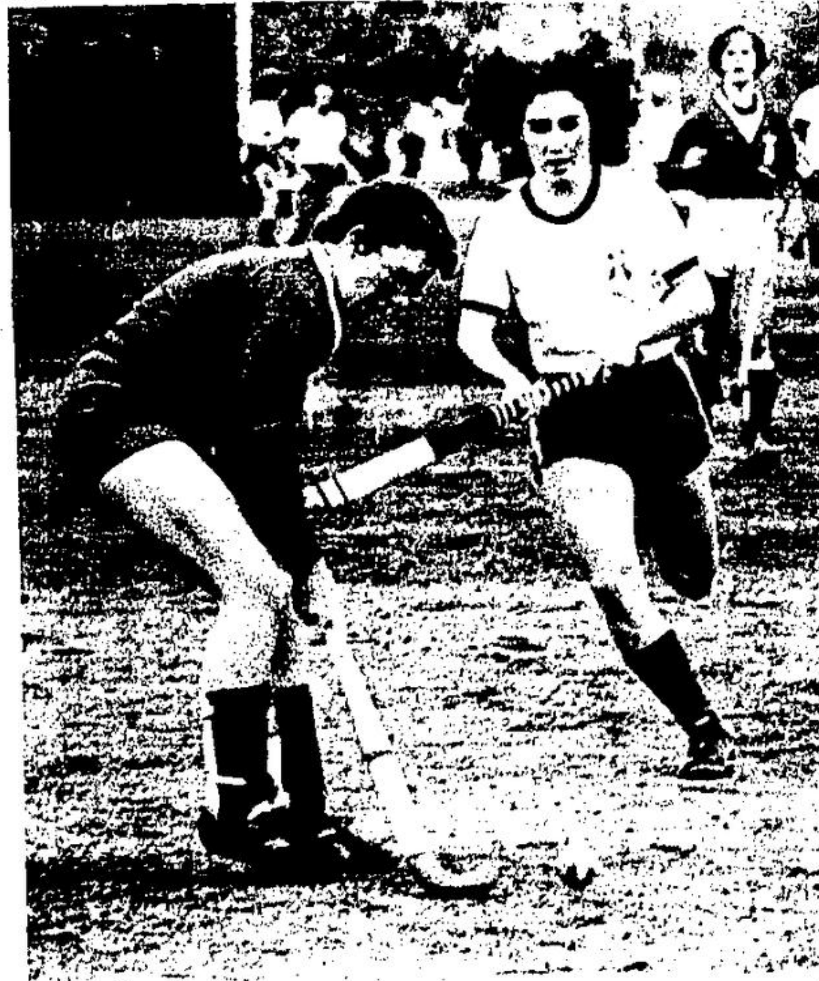
It was this kind of aggressive play by the Rebels junior girls field hockey team (in white here) that gave them two victories last week. Here the team is up against Pearson at home.