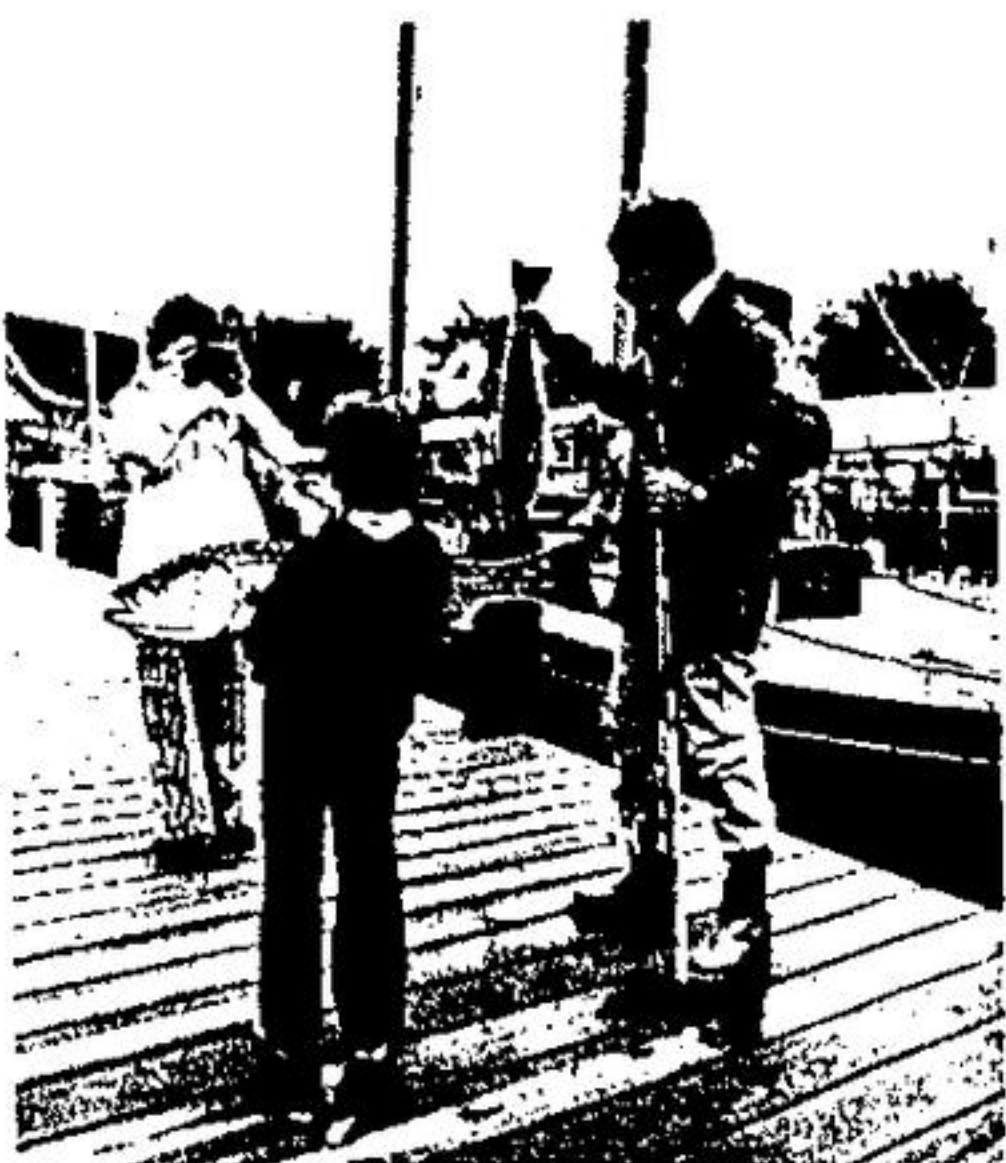
There is nothing fishy about Mom's catch. She's picturing her family with a Kodak Tele-Instamatic 608 camera which lets you take pictures two ways—normal and close-up.

Relive outdoor adventures in pictures, movies