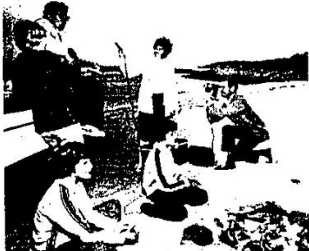
From beach blanket jaunties to countless county fairs you'll find sights and sounds worth saving... with a Kodak Ektachrome movie camera. Even spontaneous family jam sessions will make your sound movies sing!

ations. For finer grain, Kodachrome 40 sound movie film is recommended.