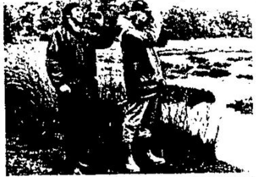
In fog and haze or glorious days, duckmen and bird watchers will welcome Bushnell Custom Compact and Instant Focus Binoculars to bring the ducks and geese into sharp, clear view.

Years ago few people used binoculars until these "elegant opera house optics" became essential in spectator sports. But today, many people are familiar with binoculars' practical uses. No longer just for theater and sports spectacles, today these twin barreled optical devices whose prisms deflect and extend incoming light are frequent companions in the Great Outdoors! Numbers will help. Choosing the right binoculars for your outdoor needs needn't be a tricky numbers game. If you let the numbers help! Decode the first two clue numbers: binoculars, meaning double eyes; in the name 7x35mm — one for magnification and the other for brightness — to reveal the mystery. The first number, a seven, means the subject will seem seven times closer to you. An osprey swinging 70 feet away would seem to be only 10 feet away. The higher this number, the greater the power. For brighter image. The second number is the diameter of the front or objective lens, recorded in millimeters. The greater this number, the brighter the image you'll see. Don't overpower the