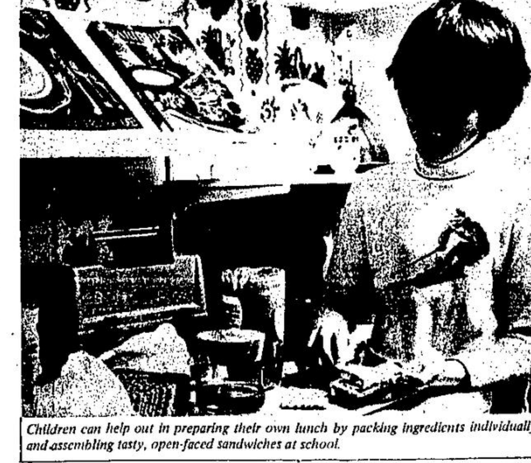
Children can help out in preparing their own lunch by packing ingredients individually and assembling tasty, open-faced sandwiches at school.