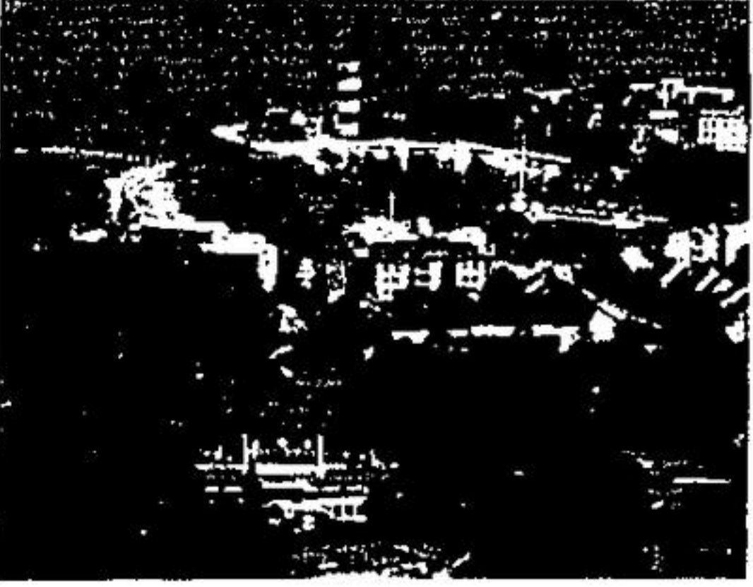
THE FAMED FAIRWAYS of the Harbor Town Golf Club, site of the annual Heritage Golf Classic held each March, are just one of the attractions to be found at the Sea Pines Plantation resort at Hilton Head, S.C.

Four championship golf courses, 45 tennis courts, 11 miles of bicycle trails, two marinas, an equestrian center, a fishing program, a nationally known sailing school and nearly five miles of Atlantic beachfront all await the active vacationer in one lovely, unique spot—the famous Sea Pines Plantation resort at sunny Hilton Head Island in South Carolina. You've probably already seen lovely Sea Pines Plantation, in fact, as its famous Harbour Town Golf Links, ranked by the World Atlas of Golf as one of the top courses in North America, are the site of the nationally televised annual Heritage Golf Classic. Sea Pines can also boast national television coverage of more than 11 tennis tournaments, including the prestigious World Invitational Tennis Classic and the Family Circle Cup, one of the four top women's sports events in the U.S. But even if you're not Billie Jean King or Arnold Palmer, Sea Pines Plantation has a lot to offer, and non-athletic vacationers should definitely check into it.