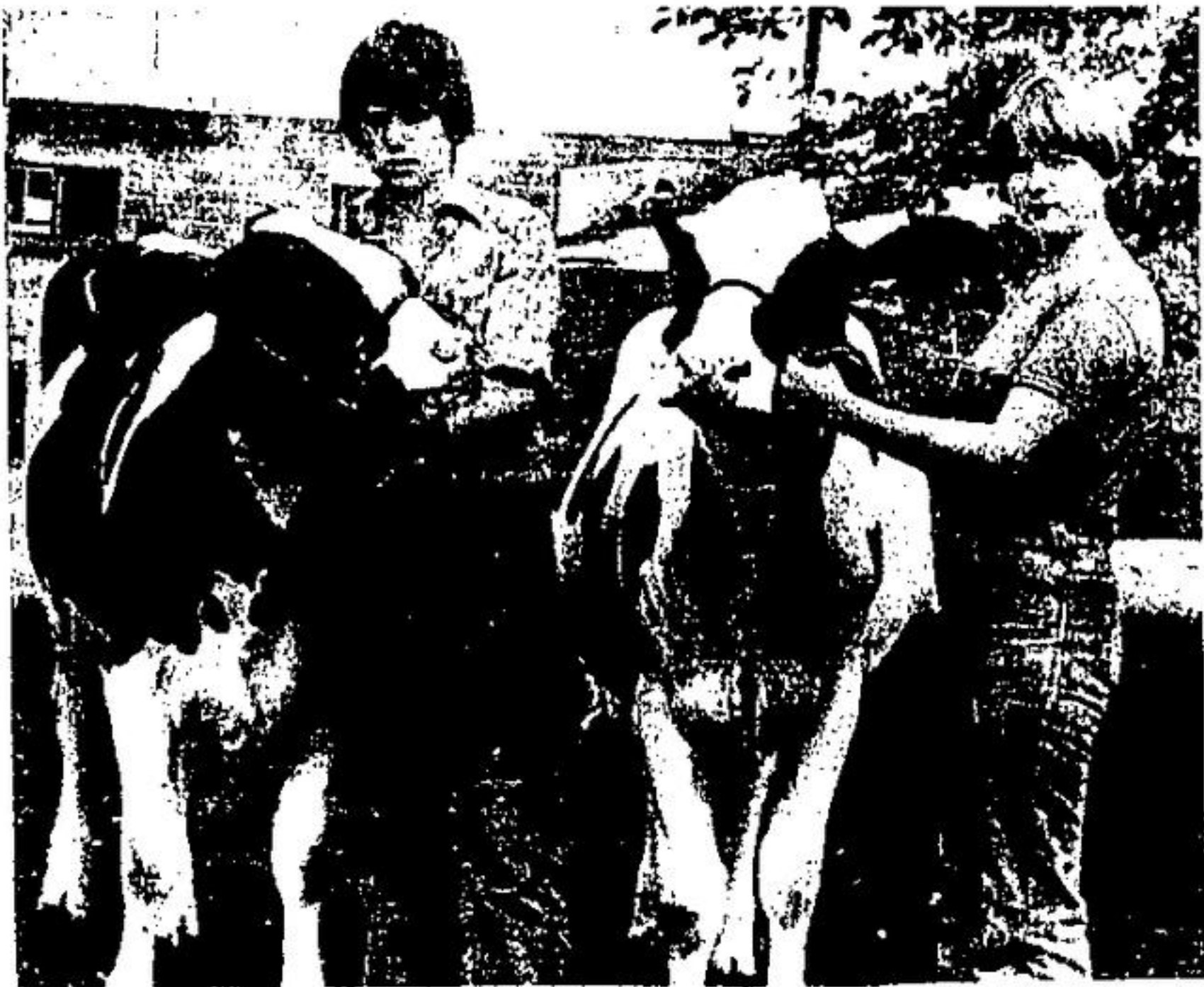
Calf club winners