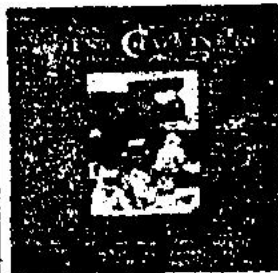
Eric Clapton "No Reason To Cry"