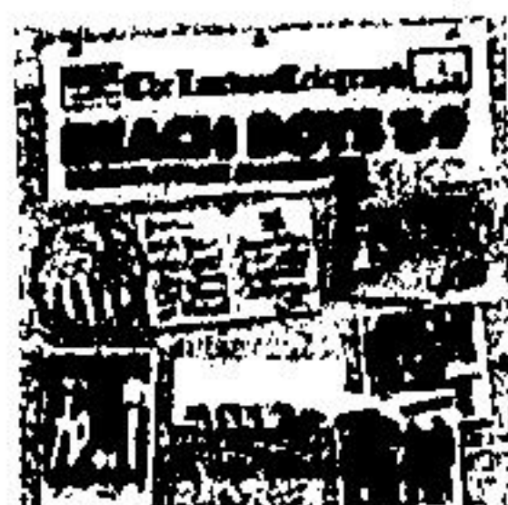
The Beach Boys "Live In London"