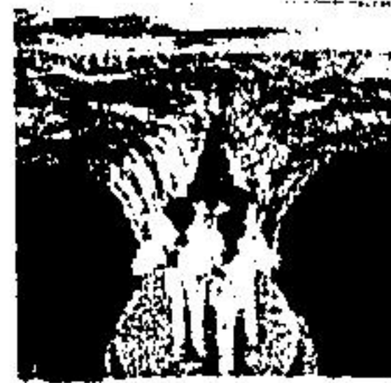
The Miracles "Do It Baby"