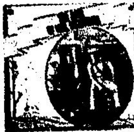
The Righteous Brothers "The Sons of Mrs. Righteous"