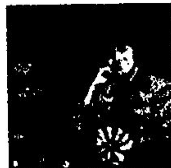
Glen Campbell "Southern Nights"