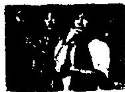
The Eric Burdon Band "Sun Secrets"