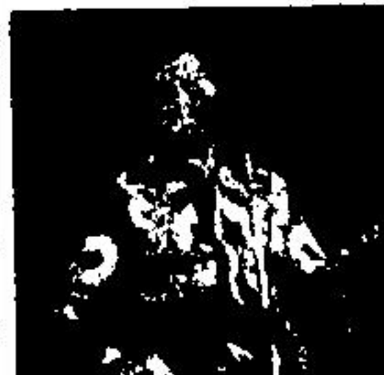
Freddie Hart "People Put To Music"