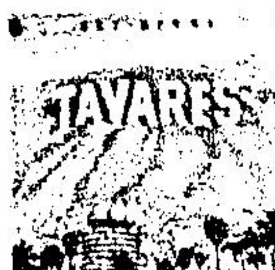
Tavares "Sky High"