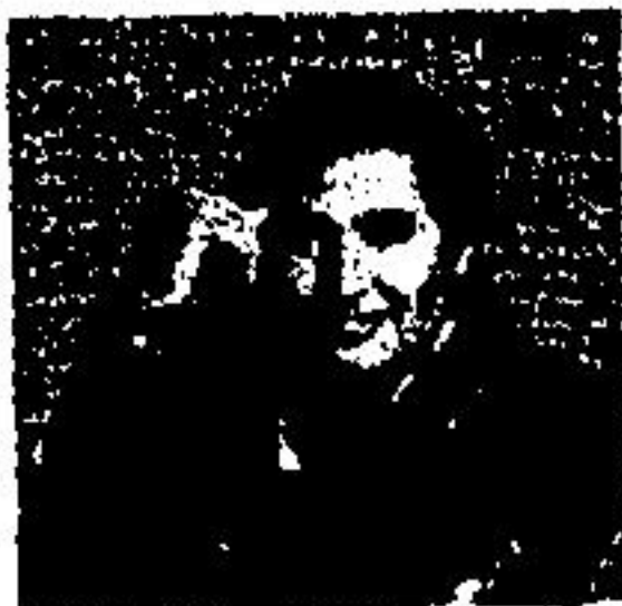
Neil Sedaka "Steppin' Out"