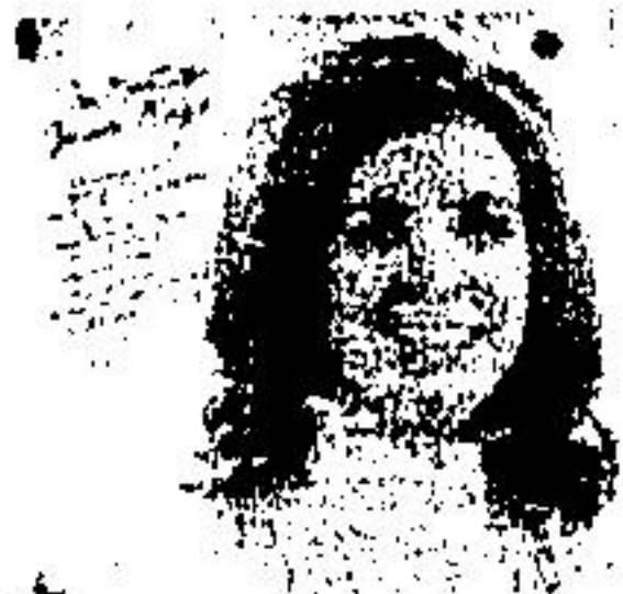
The Best of Susan Raye