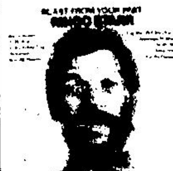
Ringo Starr "Blast From Your Past"