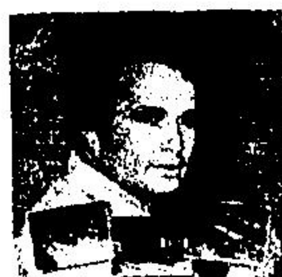
Merle Haggard "My Love Affair With Trains"