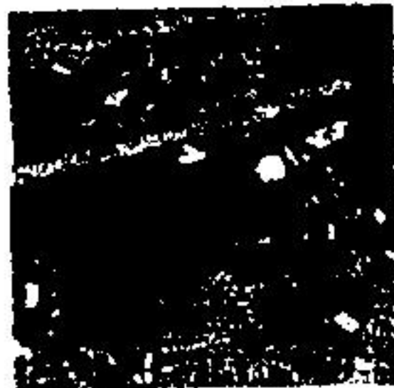
Barrabas "Heart of the City"