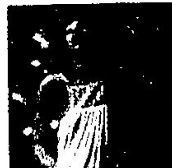
DONNA SUMMER "Love to Love You Baby"