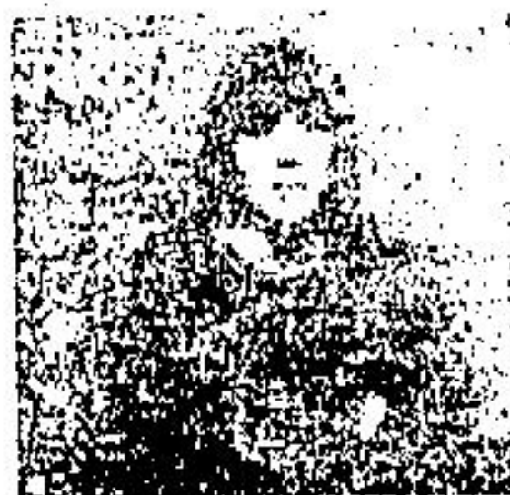
Helen Reddy "Long Hard Climb"