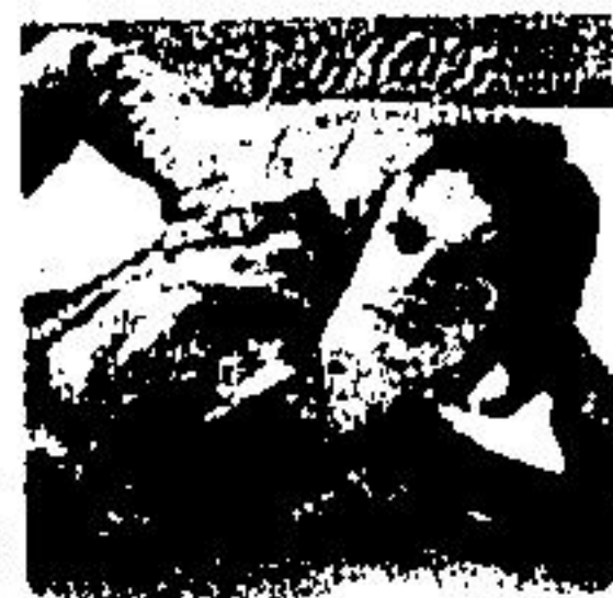
Andy Gibb "Flowing Rivers"