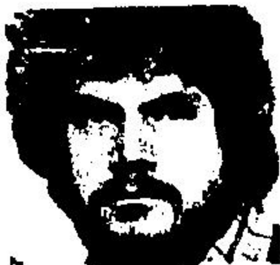
B.T.O. "Head On"