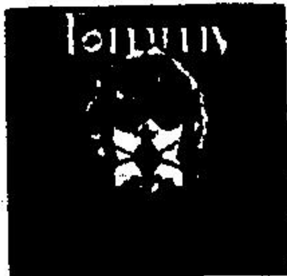
"Tommy" by "The Who" 2 Album Set