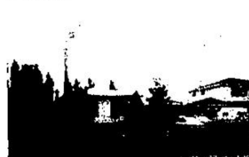
Check This One

With a fantastic view from anywhere in the 4 bedroom ranch bungalow with features such as oak pegged floors, spanish tile, octagonal living room, steel barn, chicken coop, good egg business, 2 bedroom apartment so if you want to get away from it all call Fio Matheson.