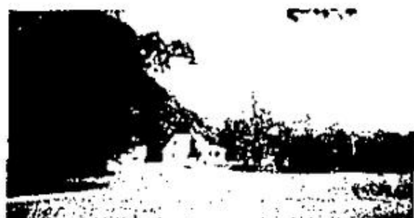
A bit of Paradise:

Charming 1 1/2 storey home. Family room, fireplace, 2 bathrooms, huge 19 x 11 kitchen, attached garage, 40 x 36 work shop for antique repair and sales or whatever the zoning is right, huge 185 x 275 lot. Priced at only $74,500. Call Herb Spitzer.