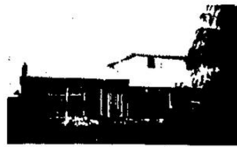
Space To Live And Grow