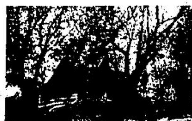
What A Setting!

Each parcel is 6.445 Acres. Mature trees, excellent pond site, Gentle Rolling Land with fantastic view. Minutes from Ski areas and convenient to small community. Priced in the 20's. Call Barb Dunleavy.