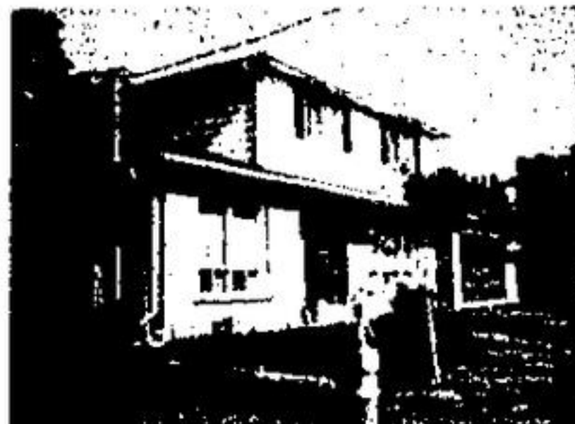
Grace And Space