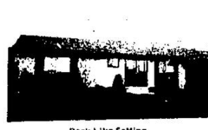
Park Like Setting

Over 300 feet of winding lane approaches the old brick farmhouse set amidst shade trees on the 47 acre farm. Huge barn, over 40 acres workable. Asking $94,500. Call Murray Baker on this Hillsburgh area home.