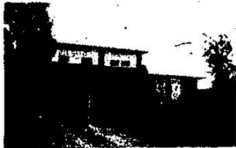
New Listing on 5 Marilyn Cres.

Drive by and enjoy the landscaping and the quiet location. Interior is excellent with well cared for floors, good decor and the big plus is an inground pool with heater, cool patio from the main floor den is private and peaceful. Then call Ellen Hogg for complete inspection of this "A1" property.