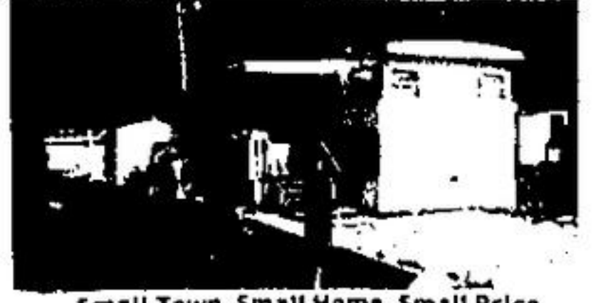
Small Town, Small Home, Small Price

High on a hill new 3 bedroom bungalow to be built. Come in and look over the plans of a formal dining room and attached 2 car garage Full price only $74,500, call Herb Spitzer.