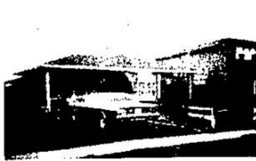
See The Interior of This Immaculate

Immaculate condition - finished rec room, extra washroom, looks out on parkland. Excellent value in very low 60's. Call Clara Brandt for full details.