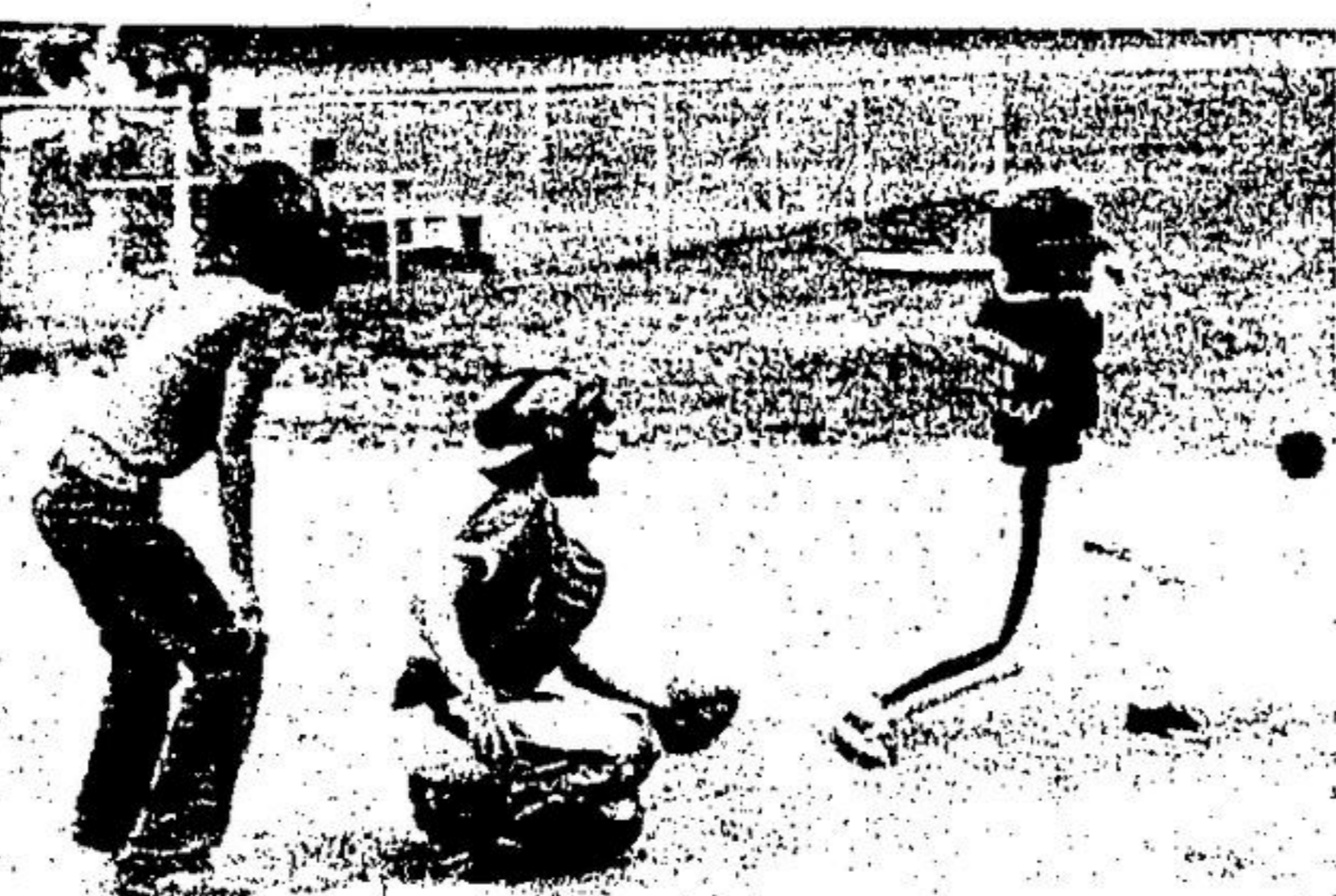
Oakville downed Georgetown Tyke Rep team Wednesday evening at the Fairgrounds.