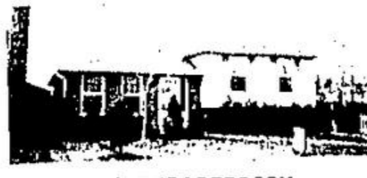
SUPER 3 BEDROOM

Before you make the final decision make sure you compare, see for yourself all the extras you won't have if you buy the other home!! Do it now. Ask your agent or call Rudy Cadieux at 877-8249 or 453-8454