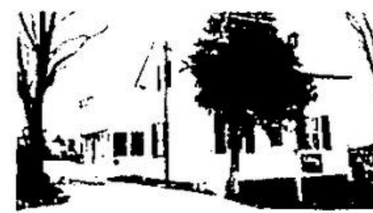
YOUR VERY OWN

Detached home. You can now buy this white beauty for only $45,900. You'll like the big kitchen and spotless large living room, 3 bedrooms, laundry room and T.V. room all add up to a fantastic bargain. Let's discuss easy terms. 243