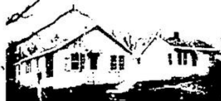
THIS BARGAIN DAY

1/2 Acre property on a ravine lot, 3 bedroom bungalow overlooking beautiful Terra Cotta. Low, low price at $57,500.