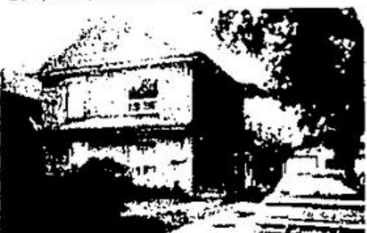
PUT YOUR MONEY TO WORK

Two for the price of one, that's right. All for $59,900. Best inflation, rent one and live in the other. Sure they are liveable, winterized and have basements. Located 15 miles north of Georgetown.