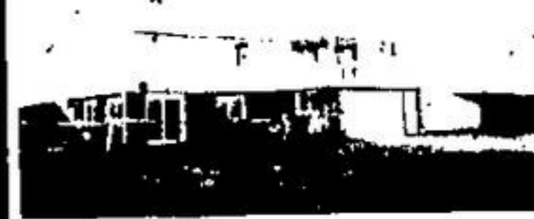
27 ROLLING ACRES

Crowned by this beautiful hillside home, custom built and featuring four bedrooms. Master bedroom suite, formal living room, spiral staircase, 2 fireplaces, inground pool. Everything in GEM condition. 244