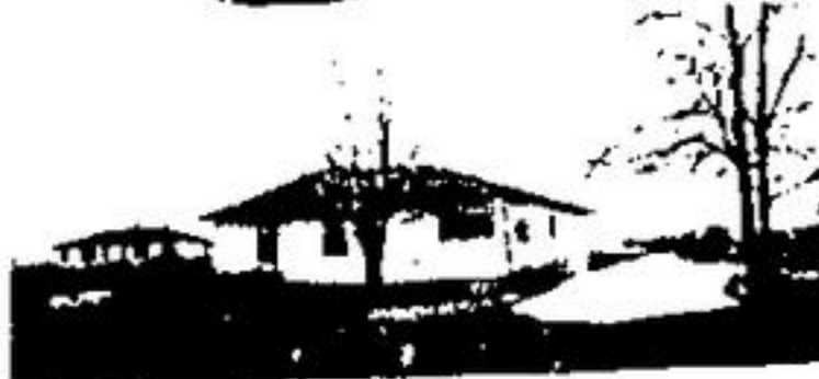
1/2 ACRE LOT

1/2 Acre property on a ravine lot, 3 bedroom bungalow overlooking beautiful Terra Cotta. Low, low price at $57,500.