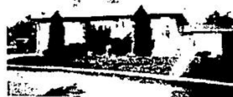
BRICK BUNGALOW PLUS

Similar model 1 yr. old, with AHOP only $2230.00 down, carries for $269. per month. 238