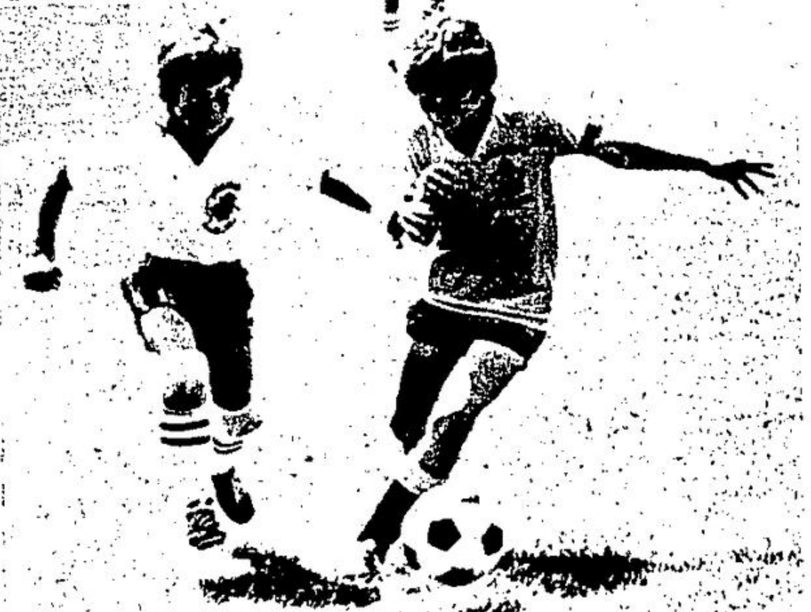
Georgetown defeated Dixie 5-2 in soccer action at Cedarville Park on Saturday.