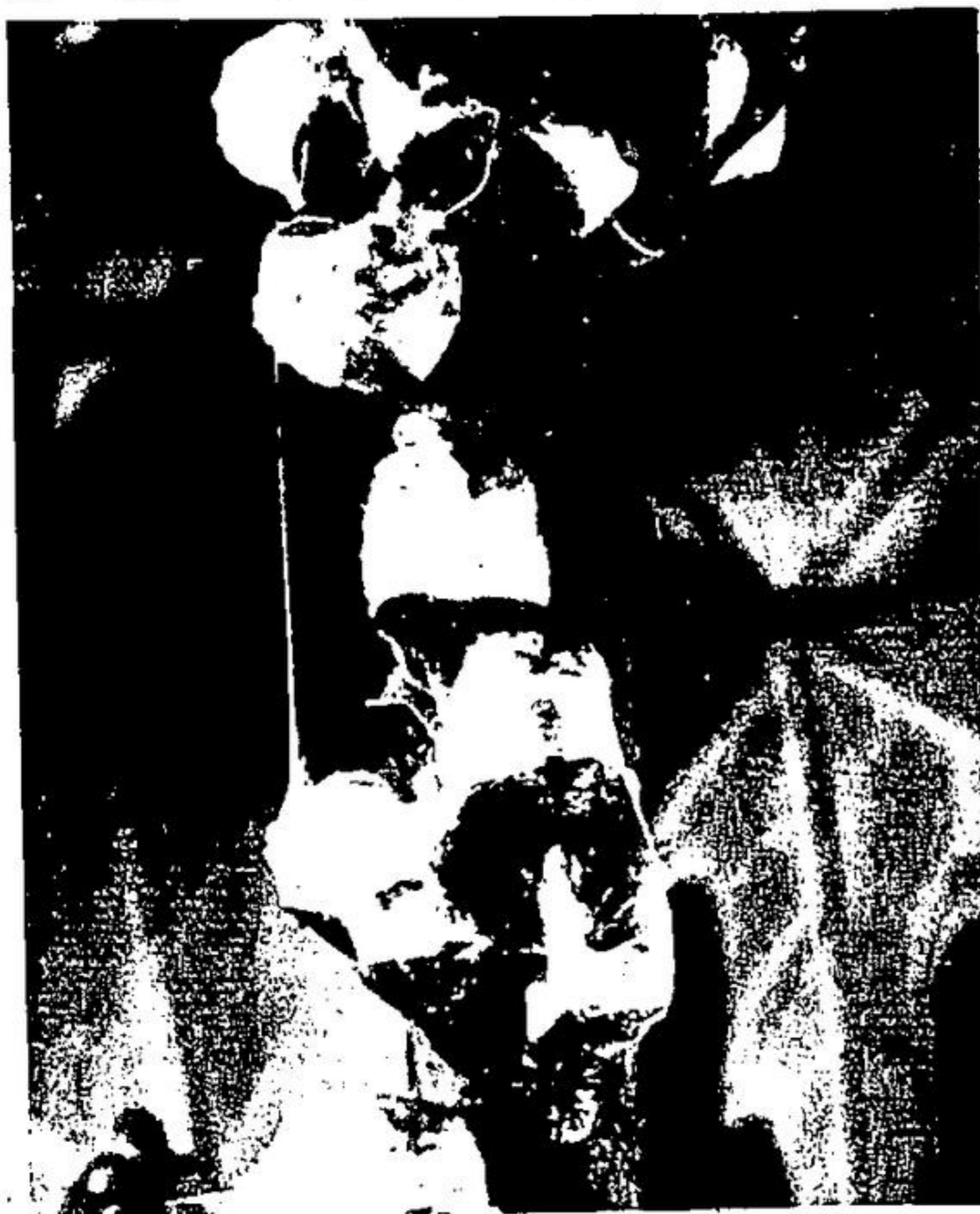
Attached to underside of branches, these caterpillar-like sawflies become conspicuous in late May through early June. Damage to heavily-infested maples may be severe. Branches are killed, foliage turns yellow and the vigor of the tree is reduced. The sticky honeydew creates problems on sidewalks and cars parked under suffering trees.