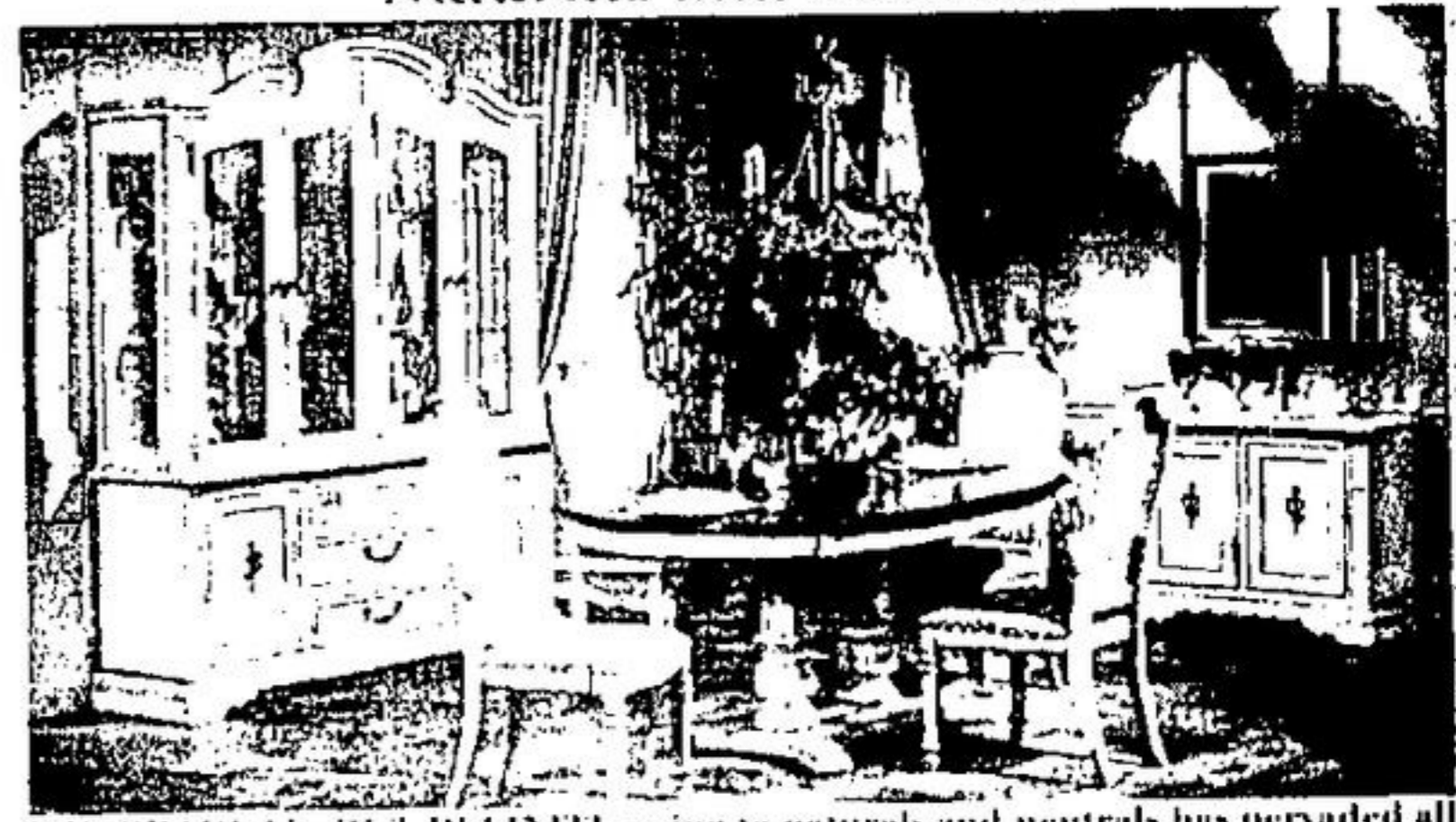
THE GRADUAL, BUT DEFINITE, swing to naturals and neutrals has pervaded all areas of home furnishings. The result is a calm, yet sophisticated approach that gives period pieces a more contemporary look. What better setting for family fare or feasts for friends than this romantic Treasury II dining room group by Stanley Furniture Co. The style is Country European with the deep honnet on the china cabinet to rich detailing outlining door and drawer panels; graceful cane-back chairs and double pedestal base supporting the dark-toned table top. Stanley has given this group a more contemporary look with an antiqued buff finish. This warm honey tone follows the trend to neutrals and naturals, while the furniture design itself still presents comfortable links with the past.