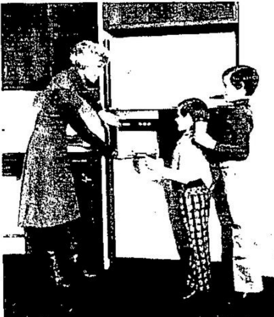
FAMILY THIRSTS ARE EASILY QUENCHED with through-the-door service of ice cubes, chilled water and two separate beverages. Frigidaire's 19.9-cubic-foot top freezer model, "The Refreshment Center," has a solid-state ice maker. Chilled water is filtered by a built-in charcoal unit for better flavor and quality, and there are two containers in the dispenser compartment, each holding 24 ounces of liquid concentrate.

The Frost-Proof system has been improved, with frostless models designed to operate their defrost cycles depending on product