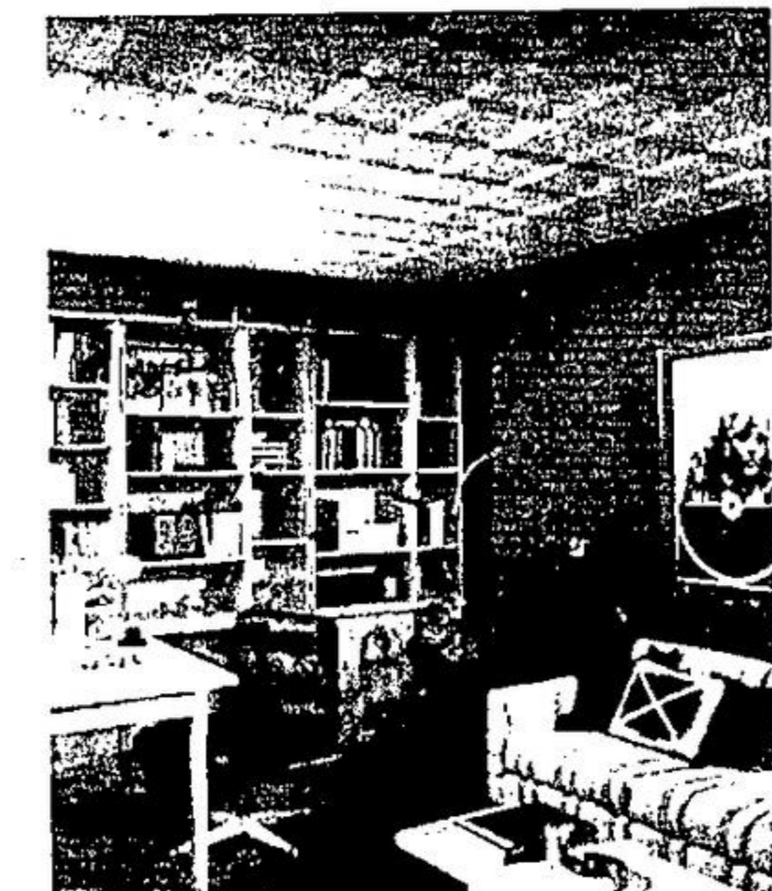
THIS SOUND-CONDITIONED family room provides a good location for the stereo. The thick carpeting and upholstered furniture muffle excess noise; the tall, solid-back bookcase serves as a sound shield for the adjoining room; and the Armstrong Chandelier acoustical ceiling helps intercept the music before it can spread upstairs.

Walls made of concrete, cinder and similar block don't present this problem because they contain a lot of holes, which absorb sound. If you paint the inside of these walls you will decrease their sound-absorbing capability.