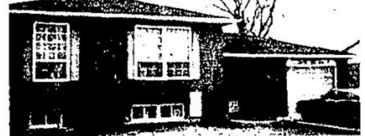
Are You Prepared

I am a four bedroom brick and cedar split level home with many special eye catching items such as fireplace with barn beam mantel main floor family room with walkout, bright and gay kitchen, with walkout to cedar deck and extra large rear yard, attached garage. Why not see the rest of the extras with Tom.