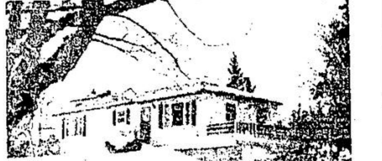
Town and Country - $52,900

This immaculate three bedroom brick bungalow on Edith Street features ground level family room with access to spectacular park like yard. Like surprises? Call Wendy.