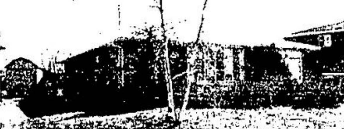
Come Look Me Over

10 acres with a small cabin and a bit of bush at rear of property. Call Norm for more details.