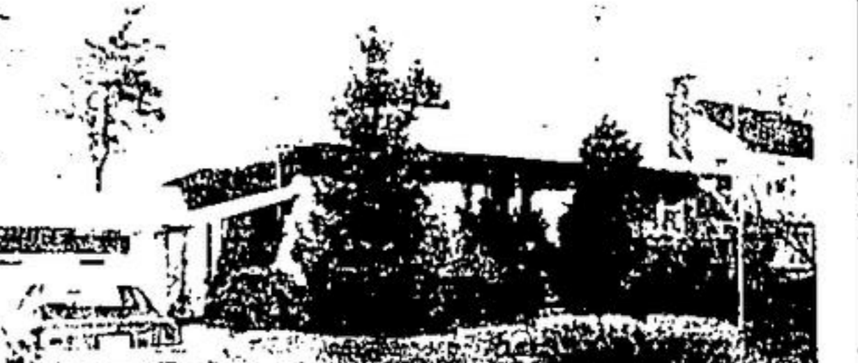
Something To Brag About

And be ready for relaxing in your air conditioned home or entertaining around your in-ground heated pool, and many other features Rozetta can tell you about.