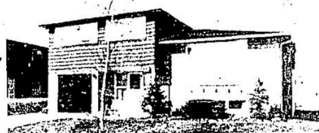
Don't "Pass Me" Buy!

Finished recreation room with wall to wall fieldstone fireplace, 3 bedrooms, living room, laundry room, beautifully decorated throughout, broadloom, paved drive, detached garage. Call Robin Fischer to view.