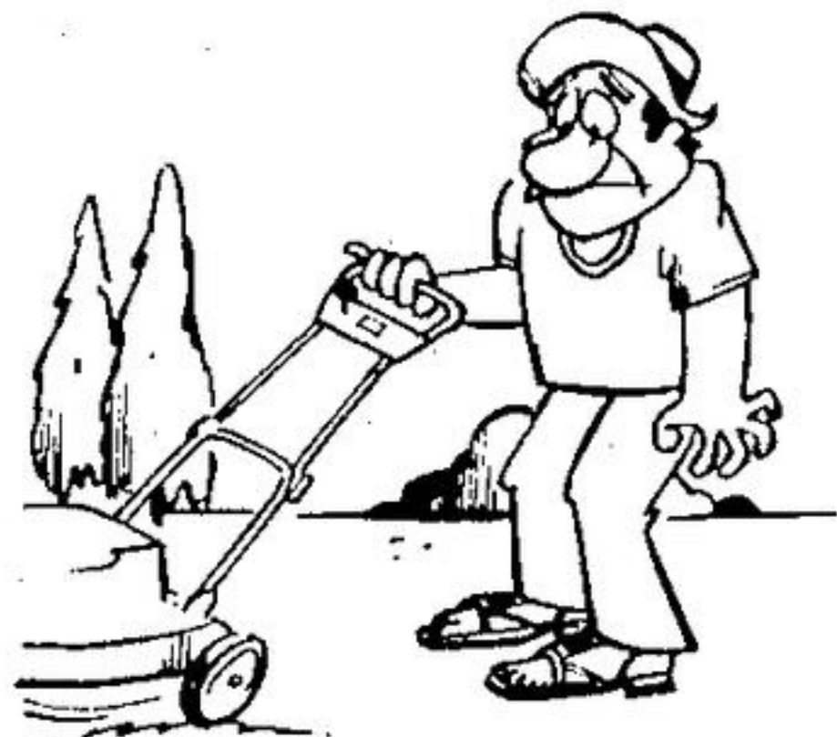
Pushing forward is always wise; mowing backward may be a surprise!

Snowfire, developed by a seed company in Japan, has bi-colored flowers of white with cherry red centers. The flowers are 1 1/2 to 2 inches in diameter with sturdy blue-green foliage.