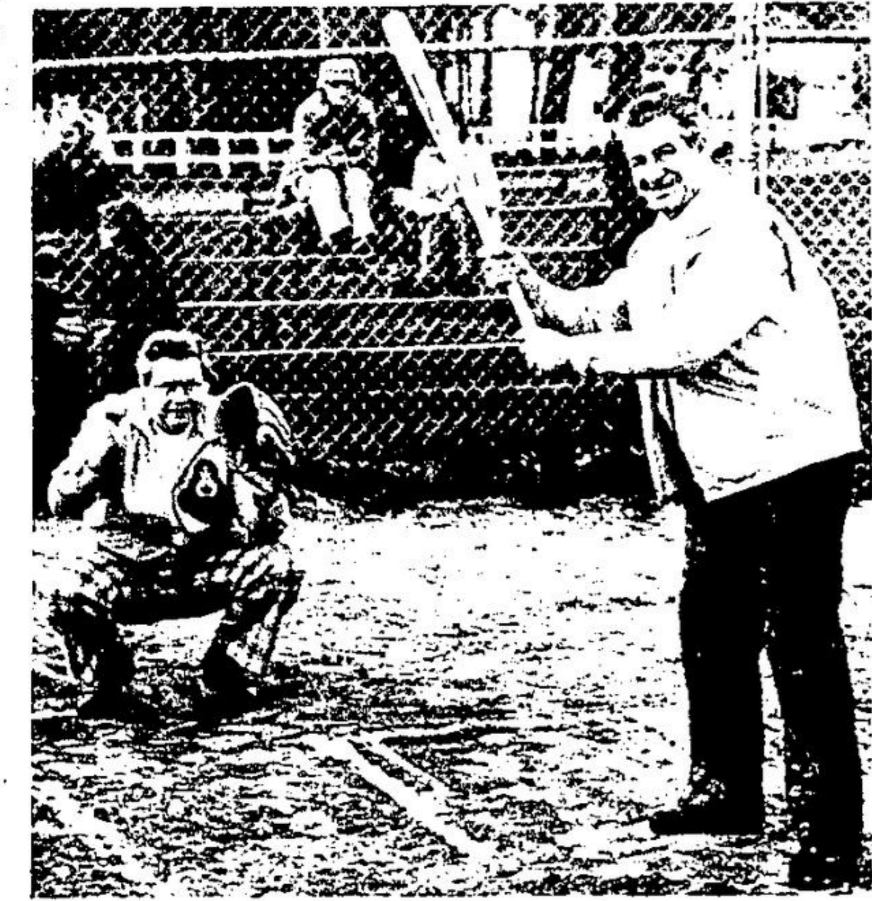
OPEN ROYALETES SEASON

Two other points also have to be raised. What good does it do to stay off the field when the top water is not draining away anyway? Why no repairs the following day and light rolling? The heavy use of our one decent field demands daily maintenance by the work crews. The problem highlights the shocking lack of facilities for the major summer recreation in town. Finally, it is essential that match reports be completed at the end of each game and immediately passed to your house league commissioner. The commissioner can then maintain the schedules, the standings and pass the reports to Susan Rose for publication each week. This Saturday morning sees the start of our three week, Saturdays, coaching. Al Doherty is talking laws of the game, Stu Robbins the coaching and Courtney Wilde the training films. Assisting with practical are myself Bryan Turner, Colin Wilde, Paul Hullbert, Erwin Wittich, Pete Skelton, Gary Spiller, Lloyd Jones and others. Players invited are Pee Wees, Bantams and Senior girls as well as house league coaches. We hope to make it interesting and fruitful. See you next week, folks.