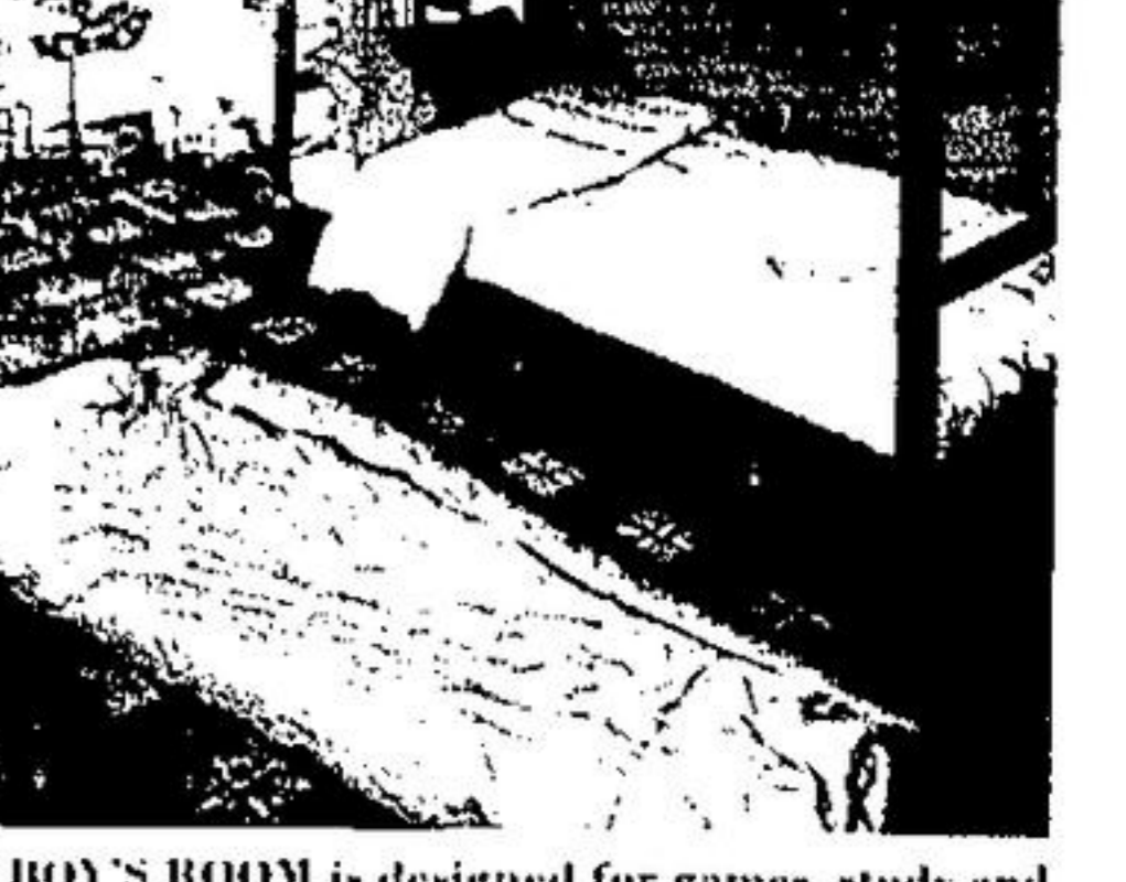
THIS BOY'S ROOM is designed for games, study and sleep-over company. Bunk beds are easy to make up with down-filled comforters. A spare bed is simple to produce — just unroll a sleeping bag and company is set for the night. Daytime activities will make good use of the ample floor space.

Information can be obtained from the Hellen Hills Community Conservation Centre, Guelphview Square, 233 Guelph St., Georgetown, Ont. M7B 1K6.