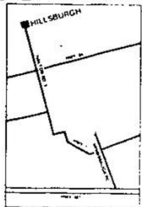
Take the 401 to Mississauga Rd. Turn north on Hwy. 7 to Hwy. 24. Turn right on Hwy. 24. Hillsburgh Estates is on the right side of the road.

Phone collect (416) 630-5575 Between 9-5 p.m.