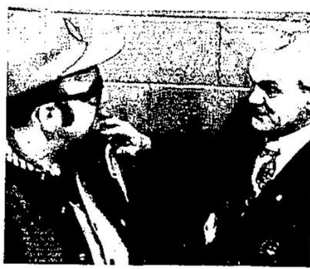
YOU DONE GOOD