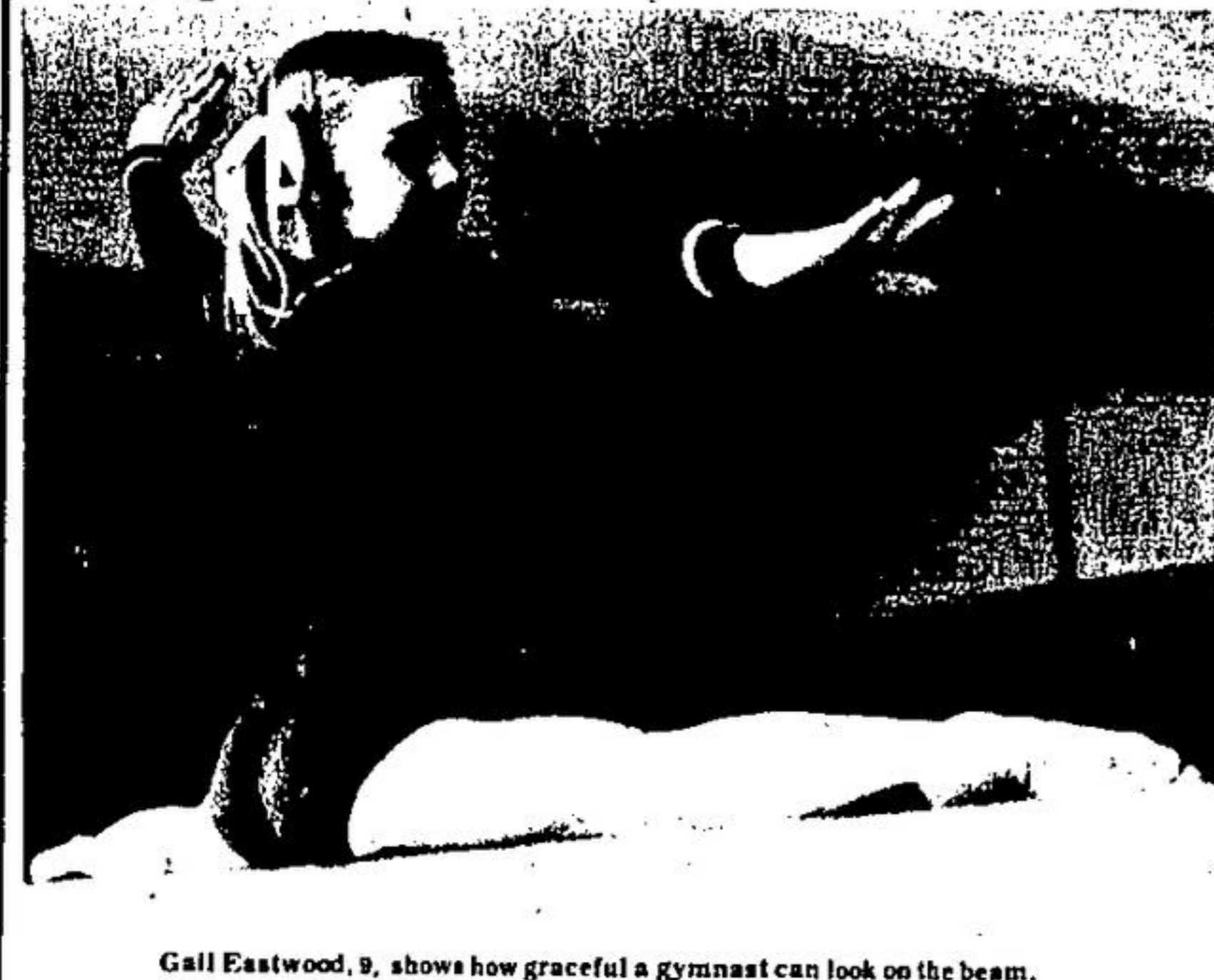
Gail Eastwood, 9, shows how graceful a gymnast can look on the beam.