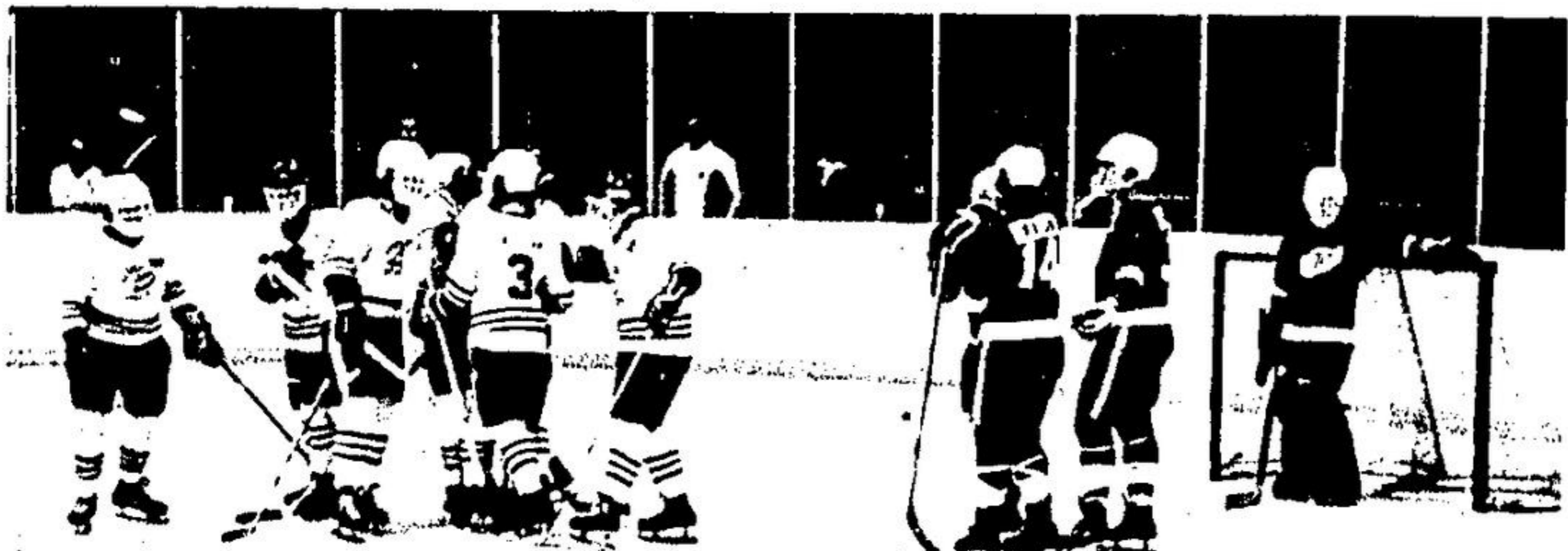
The Georgetown team celebrates a goal while the Owen Sound players ask each other what went wrong. Georgetown got by in this game, but were ousted by Hamilton in the semi-finals.