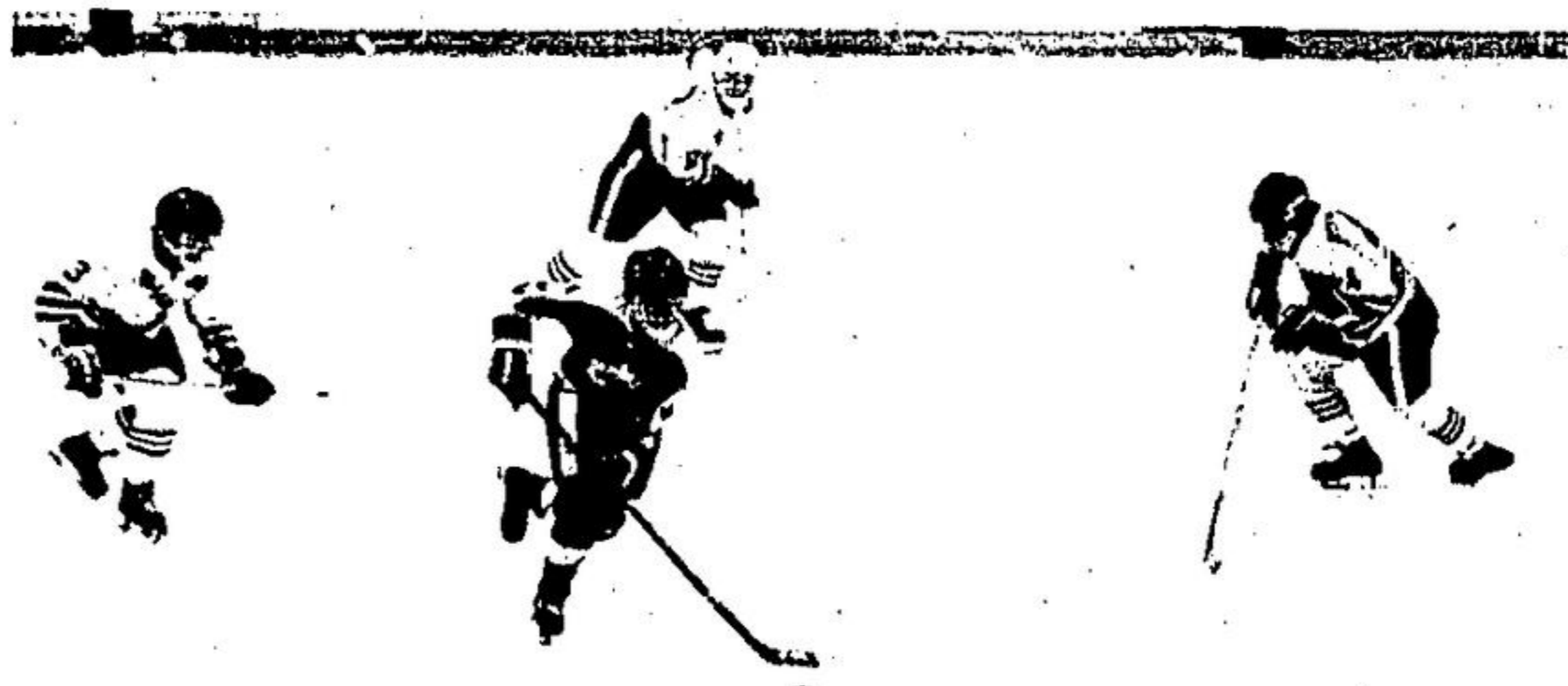
This Hamilton Huskie player tries a solo attack against the Guelph team in the opening round. Hamilton, which was heavily favored in the game, was forced to go into overtime before taking a 3-2 decision.