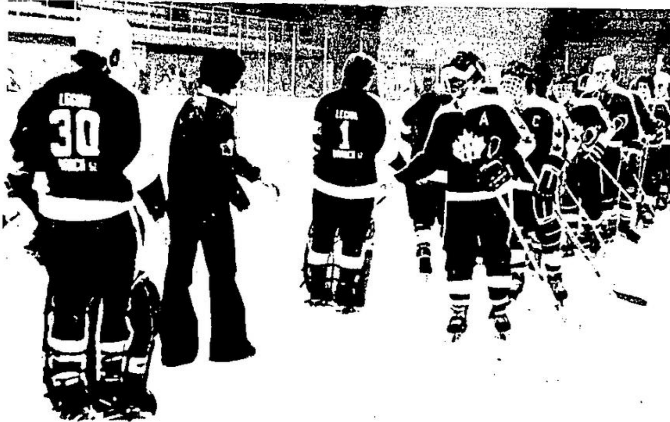
The Hamilton Huskies and Peterborough Petes go through the shaking hands ceremonies after the final game which the Petes won 5-2.

The Peterborough Petes won the annual Georgetown Midget Tournament by taking a convincing 5-2 decision over the Hamilton Huskies in the final game.