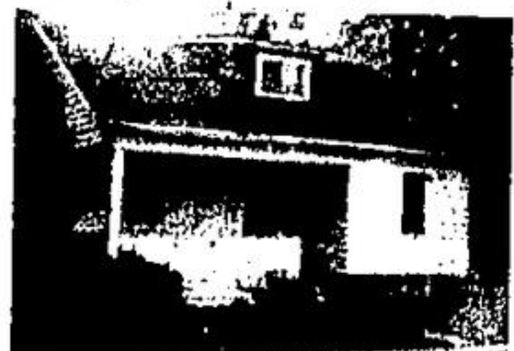
Looking For An Investment - $39,900

It's the ever popular Country Squire model, backsplit with four bedrooms, kitchen overlooks family room with wood burning fireplace. Walkout from family room to huge lot backing onto park. Asking $74,900.