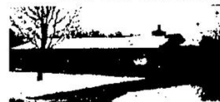
Ranch Prestige $207,500.

Looking for a house with charm. Then this house has it all, a large lot filled with hundred year old maples. The house itself has 4 bedrooms, large country kitchen with real pine cupboards. The master bedroom has high open ceilings with barn beams and hardwood floors. John Caton.