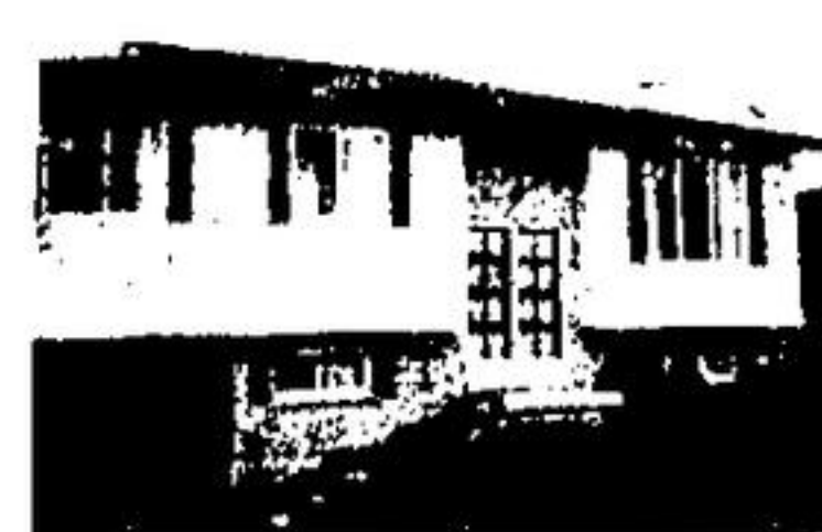
Reduced! Reduced! $66,900

Sandra Hurley 877-1268 Howard Caton 838-2708 Norm Sinclair 877-6050