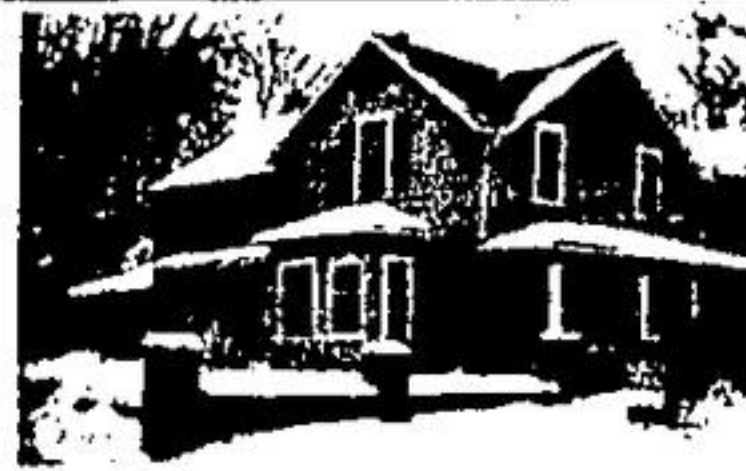
Park Area $64,900

Century Farm. This farm is situated in the lovely highlands of Caledon. There are 10 acres of mixed bush with spring fed brook, 90 acres of sandy loam soil for grains or pastureland. The house is a classic red brick 2,000 sq. ft. two storey. There are two driving sheds, one is new, both are over 100 feet long. The bank barn is recently new. Also a new 90' Harvester site and bunk feed. A real gentleman's farm. Asking $295,000. Contact John or Howard Caton.