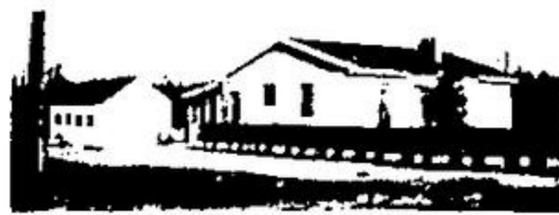
$49,900. TOAST YOUR TOES -

This fine old home has a lovely one in the large living room downstairs, also separate dining room, kitchen and 2 bedrooms. Up stairs features a spacious rented 2 bedroom apartment. Triple car garage with heated workshop at rear. Call SUSAN for full details.