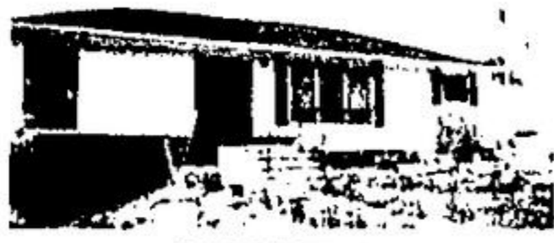
GOODBYE TO THE OLD YEAR

Before the fireplace in this cozy living room. Low maintenance 2 bedroom bungalow with fireplace, separate dining room and Florida room for next summer! Dial ANN McINTYRE for details.