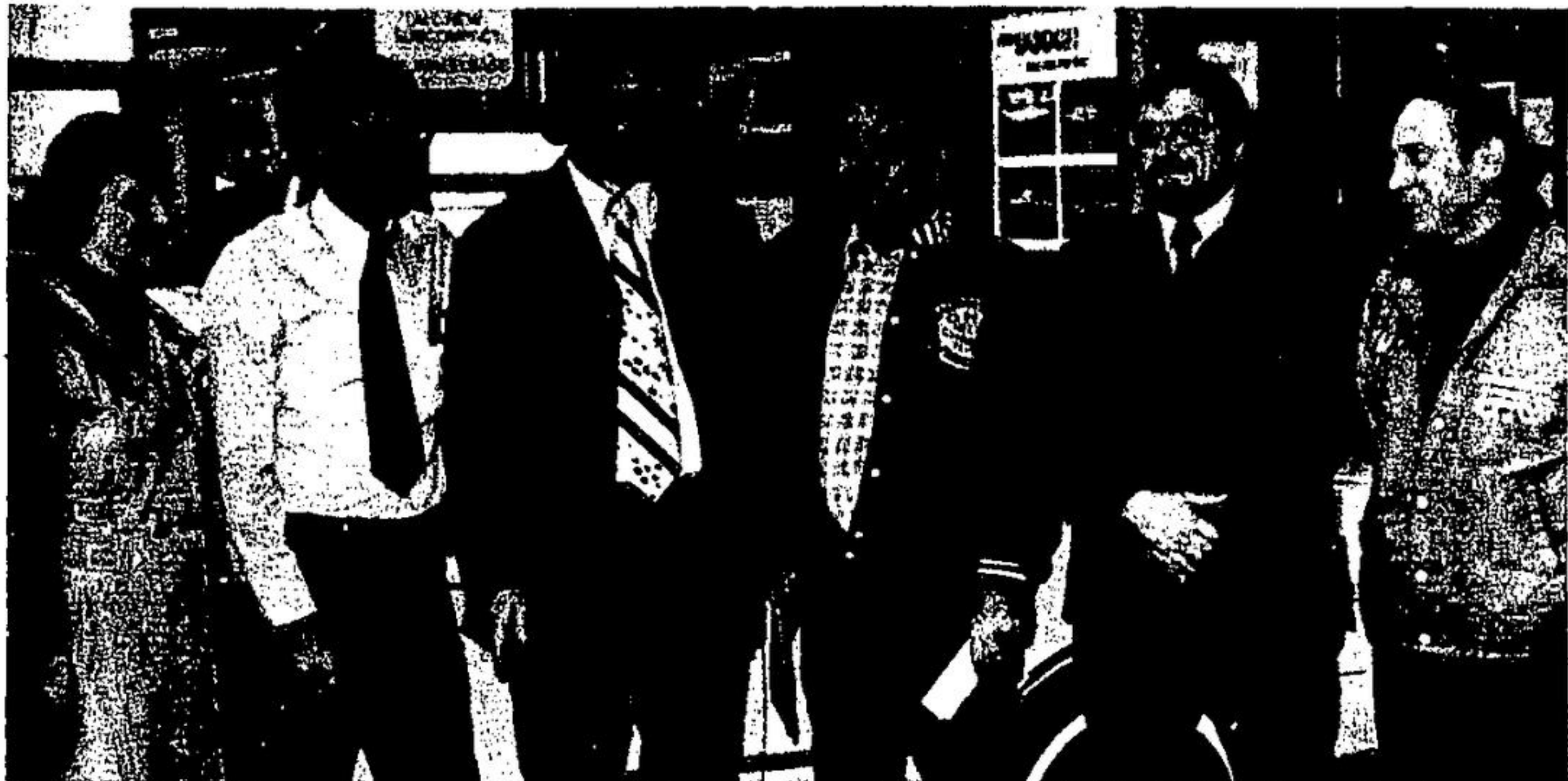
Everyone involved was all smiles when the Georgetown Chrysler Raiders announced their new ticket promotion. The Raiders will be letting children and students in with Canadian Tire money and 25 per cent of the proceeds will be shared by Georgetown District Minor Hockey Association and the support group.

Official C.F.I. yearbook for sale at Canada Trust. 160 action-packed pages with a section on each team.