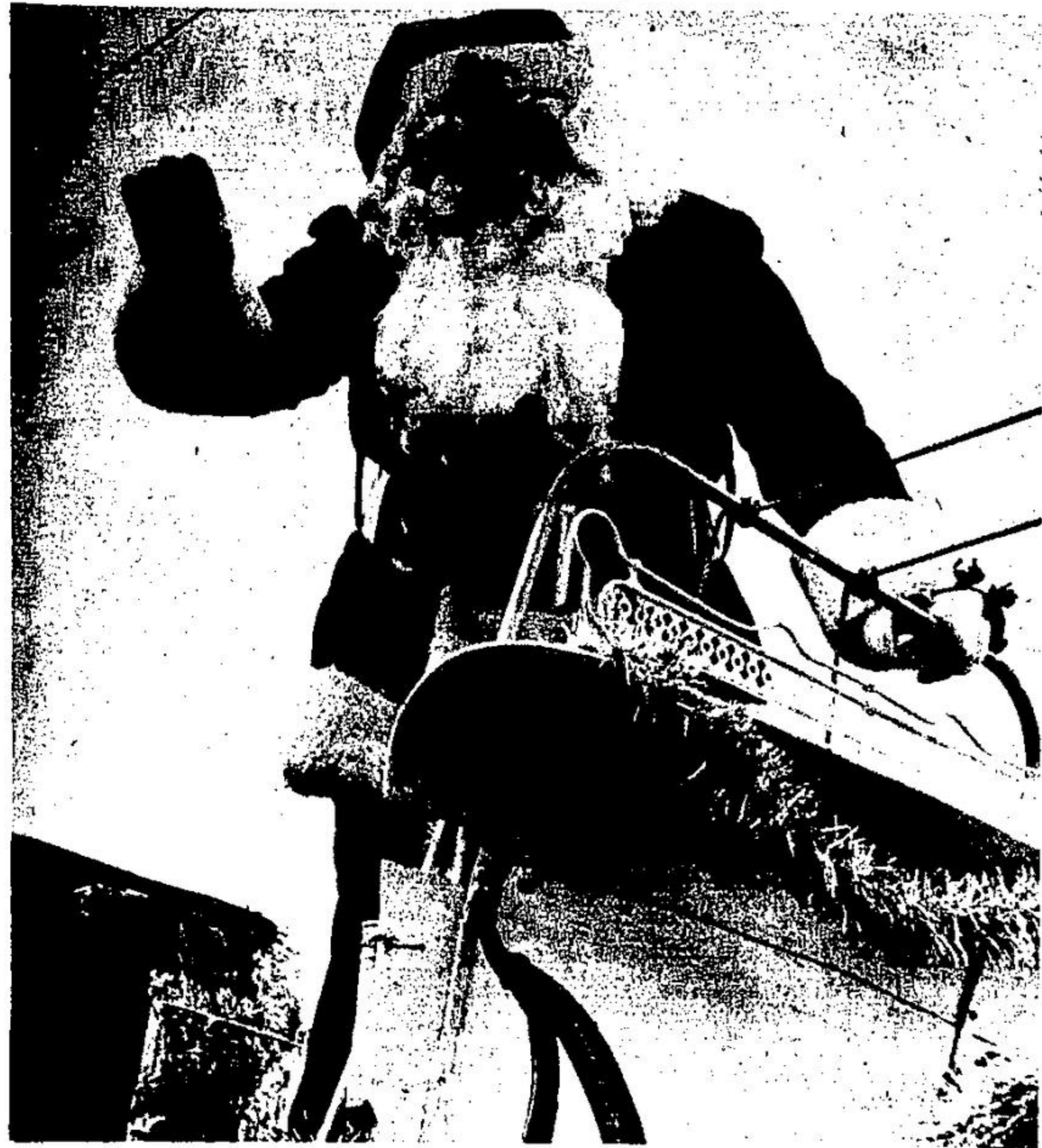
The jolly old gent arrives officially in Georgetown Saturday amid the sighs and cheers of the little people who lined the parade route.