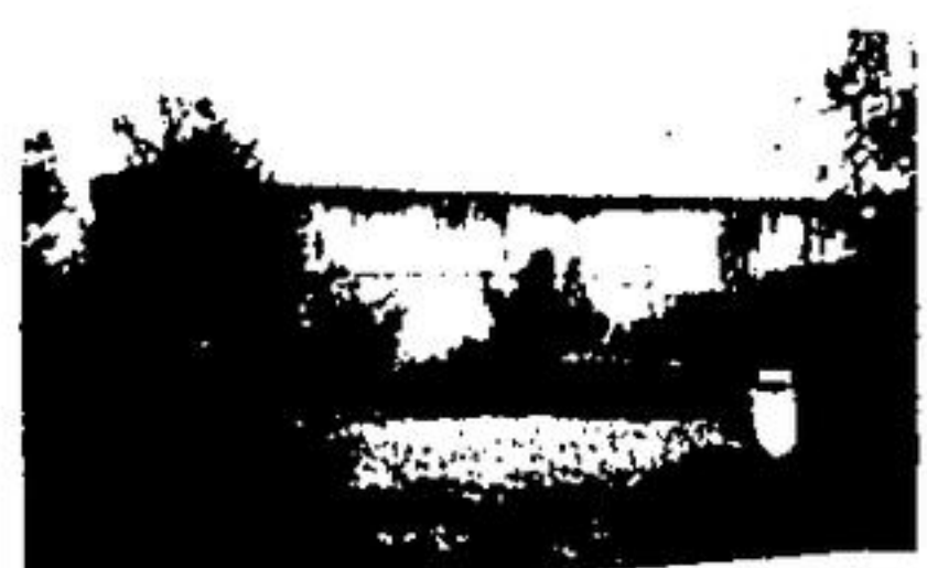
LOOKING FOR YOUR FIRST HOME?

JUST LISTED! Executive living, 3 bedrooms, 4 bathrooms, 2 sunken tubs, 2 fireplaces, 2 acres for the two of you. Small 2 storey barn. Many extras. Call Peter Thornton 877-5237.