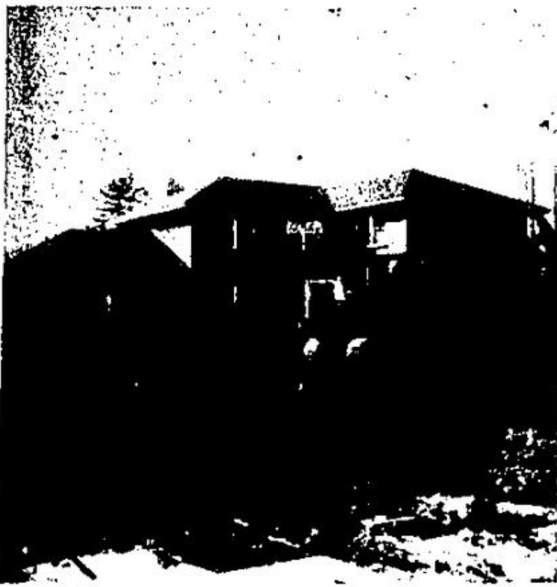
The Oakwood House