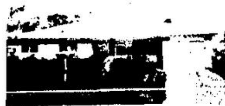
Clean and Spacious

Excellent value in this 4 bedroom, 2 baths, 2 storey home near schools and shopping. Vendor is being transferred and asking only $64,900. Call Sandra for an appointment.