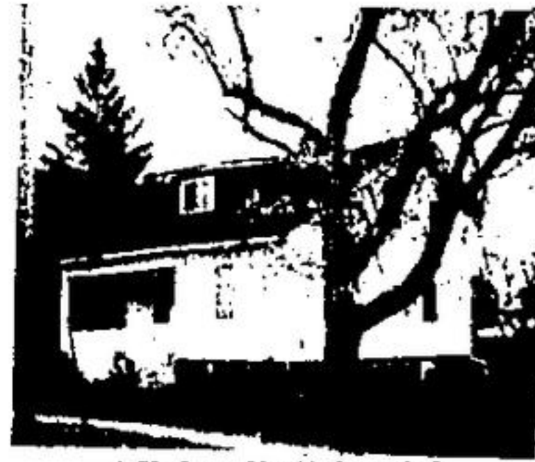
"Fixing Up" Special

Sandra Hurley 877-1268 Howard Caton 838-2708 Norm Sinclair 877-6050