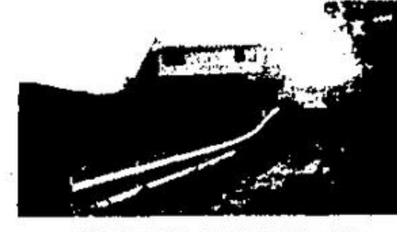
WEST OF GEORGETOWN COUNTRY HOME 3/4 ACRE $59,900!