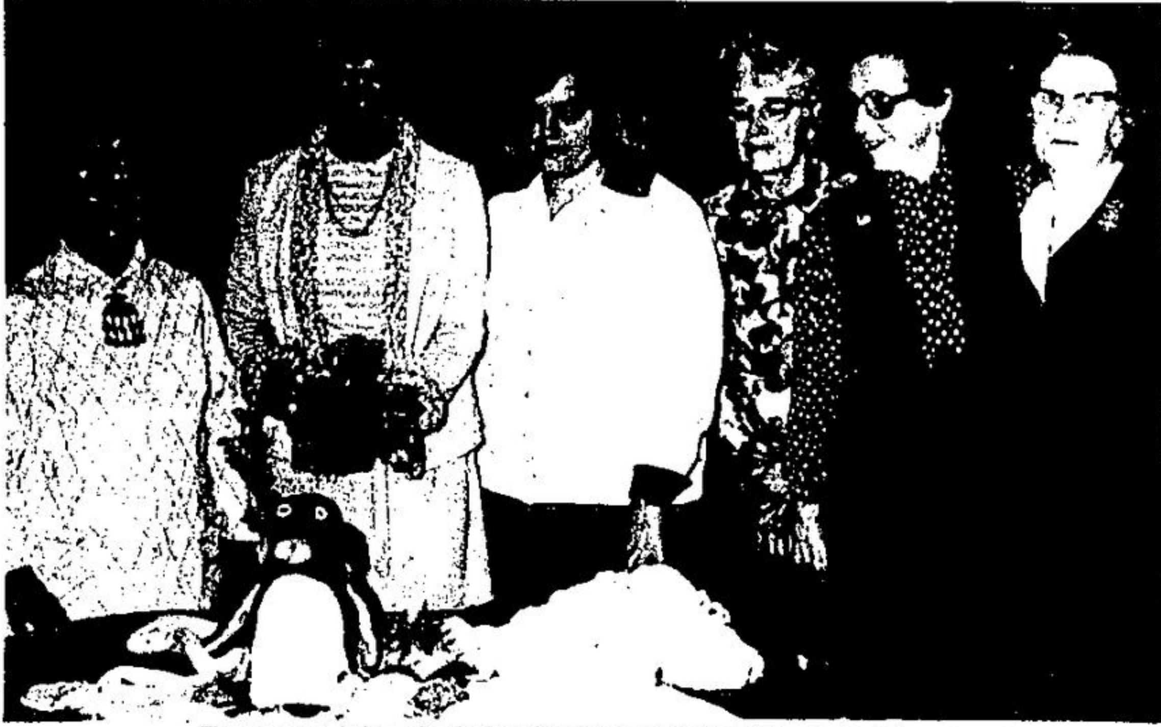
These women, knitters for the Canadian Cancer Society, met for the first time at a get-acquainted gathering last week which was organized to thank them for their work.