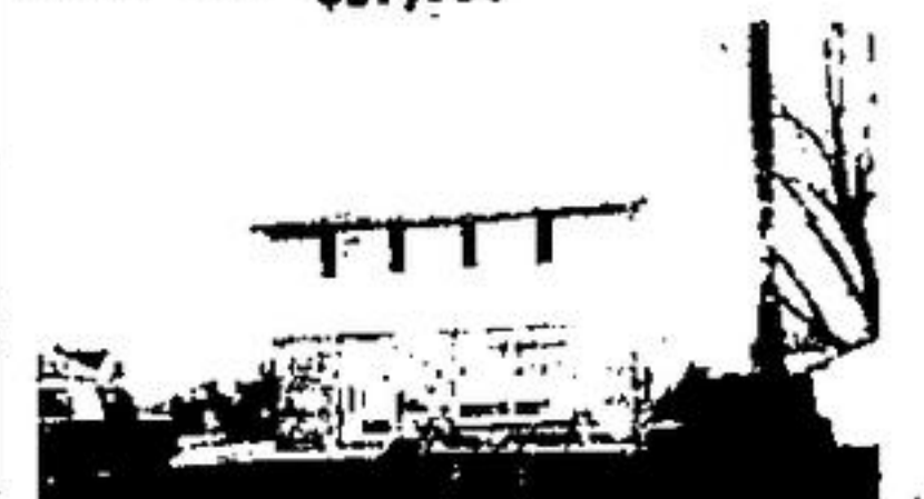
WORTH EVERY DOLLAR

Split level design with oodles of space. Large sunken living-dining and kitchen area plus four bedrooms. Less than 2 years old, this low maintenance semi detached home is newly listed at only $56,900