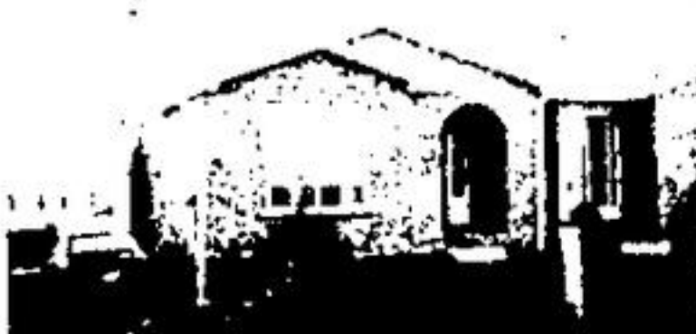
AS GOOD AS NEW

Just listed 1000 sq. ft. stone fronted brick bungalow. 3 bedrooms, huge living room, full, extra high basement. All on a half acre country lot. Ahh here you can breathe again. Price only $57,900