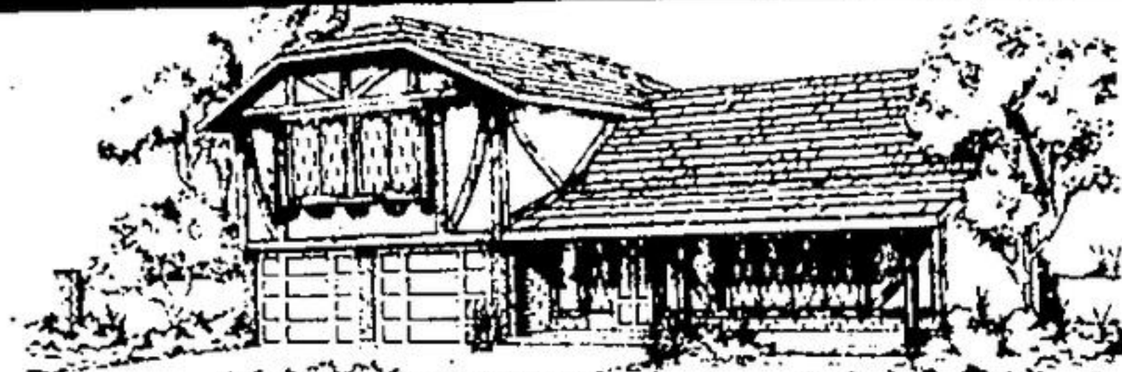
WOULDN'T IT BE LOVELY?

Picture this home on a beautiful lot of your choice on Mullen Place just North of Georgetown. A few 100 ft. frontage properties are still available. Buy now for early spring occupancy.