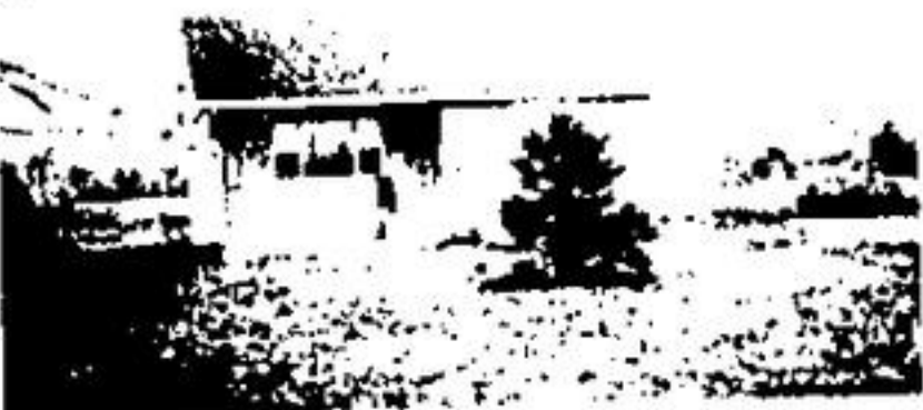
AFFORDABLE COUNTRY HOME

Picture this home on a beautiful lot of your choice on Mullen Place just North of Georgetown. A few 100 ft. frontage properties are still available. Buy now for early spring occupancy.