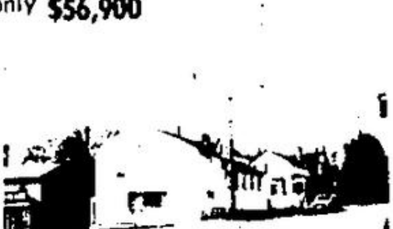
GUELPH STREET CORNER PROPERTY

Ultra clean 2 storey four bedroom home with extra 2 pc. washroom, large kitchen. Deep lot with vegetable garden, detached garage and much more. Imagine, 3 years new and only $54,900