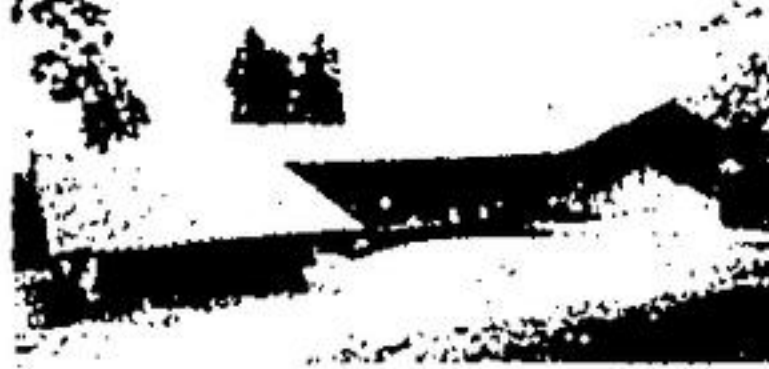
EXECUTIVE COUNTRY RETREAT

Very clean, 3 bedroom townhouse close to shopping and transportation. Rec. room started. $42,900