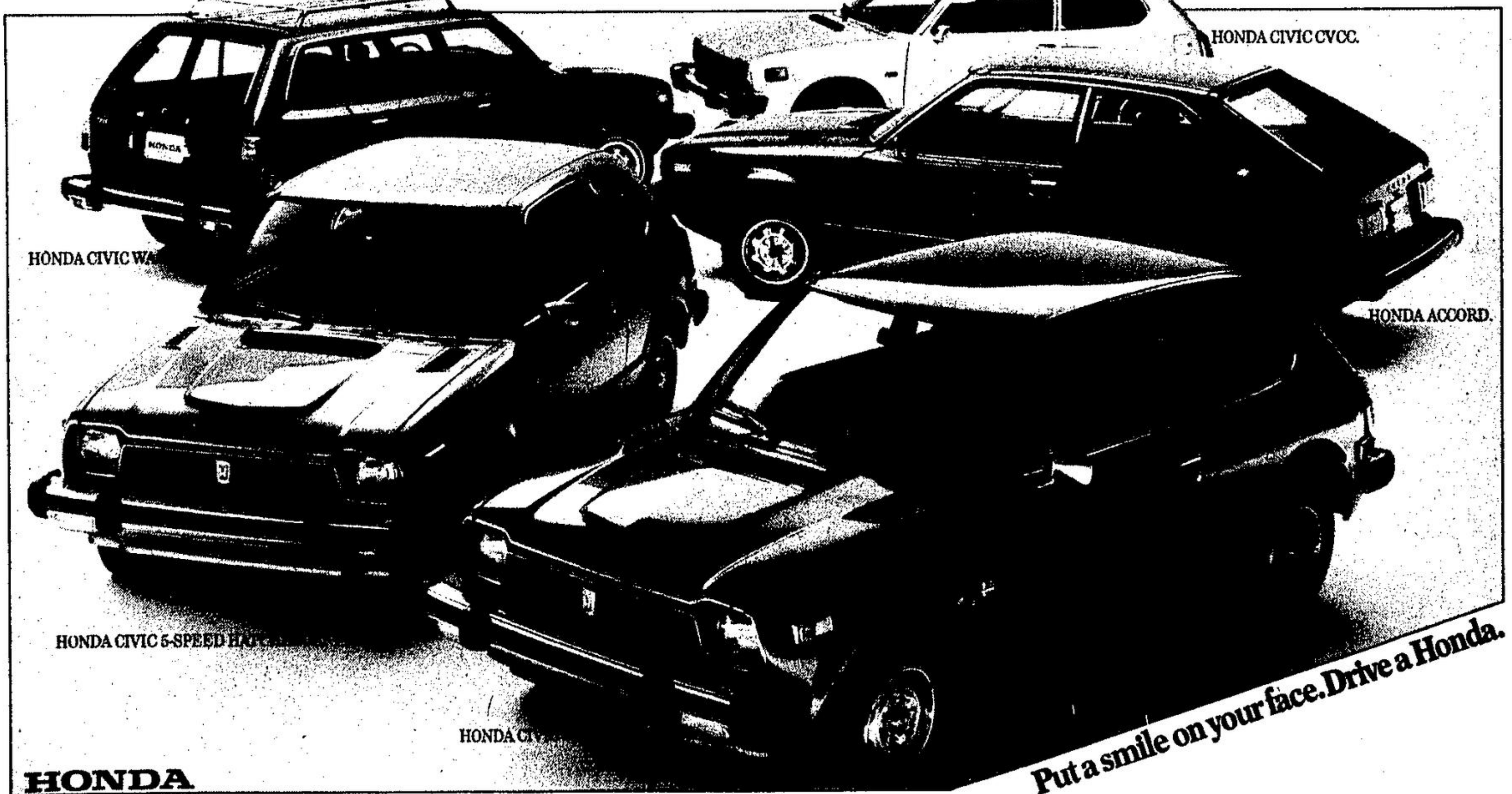
HONDA CIVIC WA

And that's not just among imports, that's in the whole league. From Cadillacs