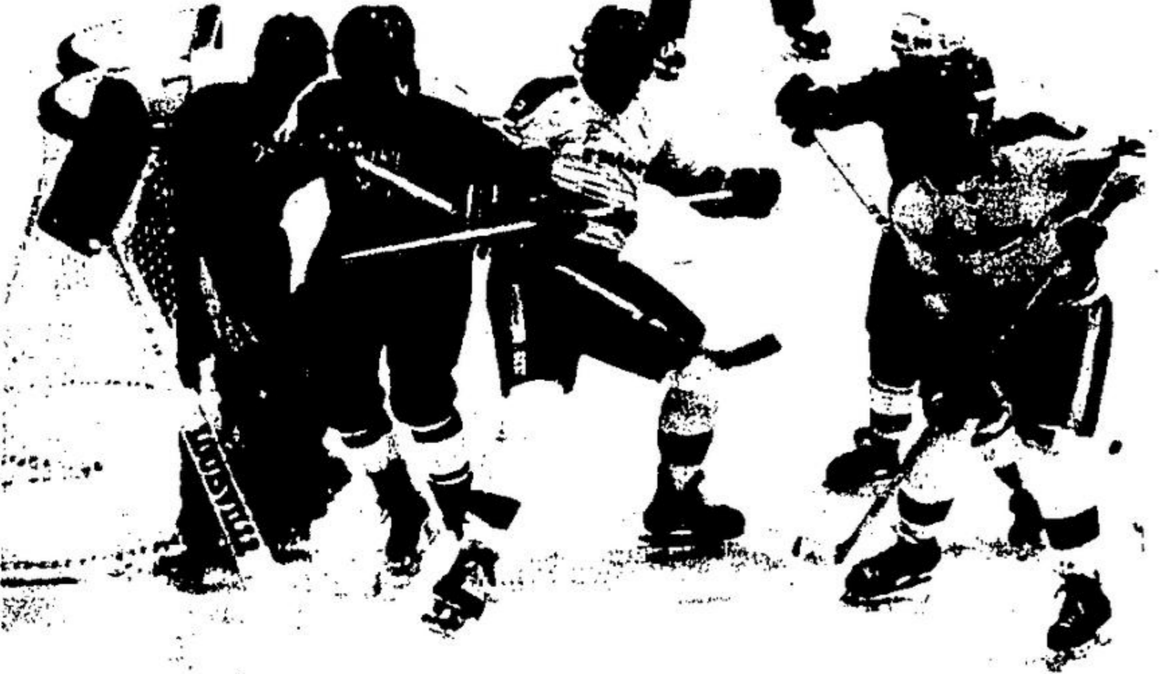
Friday night the Raiders spent plenty of time around the Fort Erie crosse, unfortunately the puck saw the backside of the Fort Erie goalie only once.