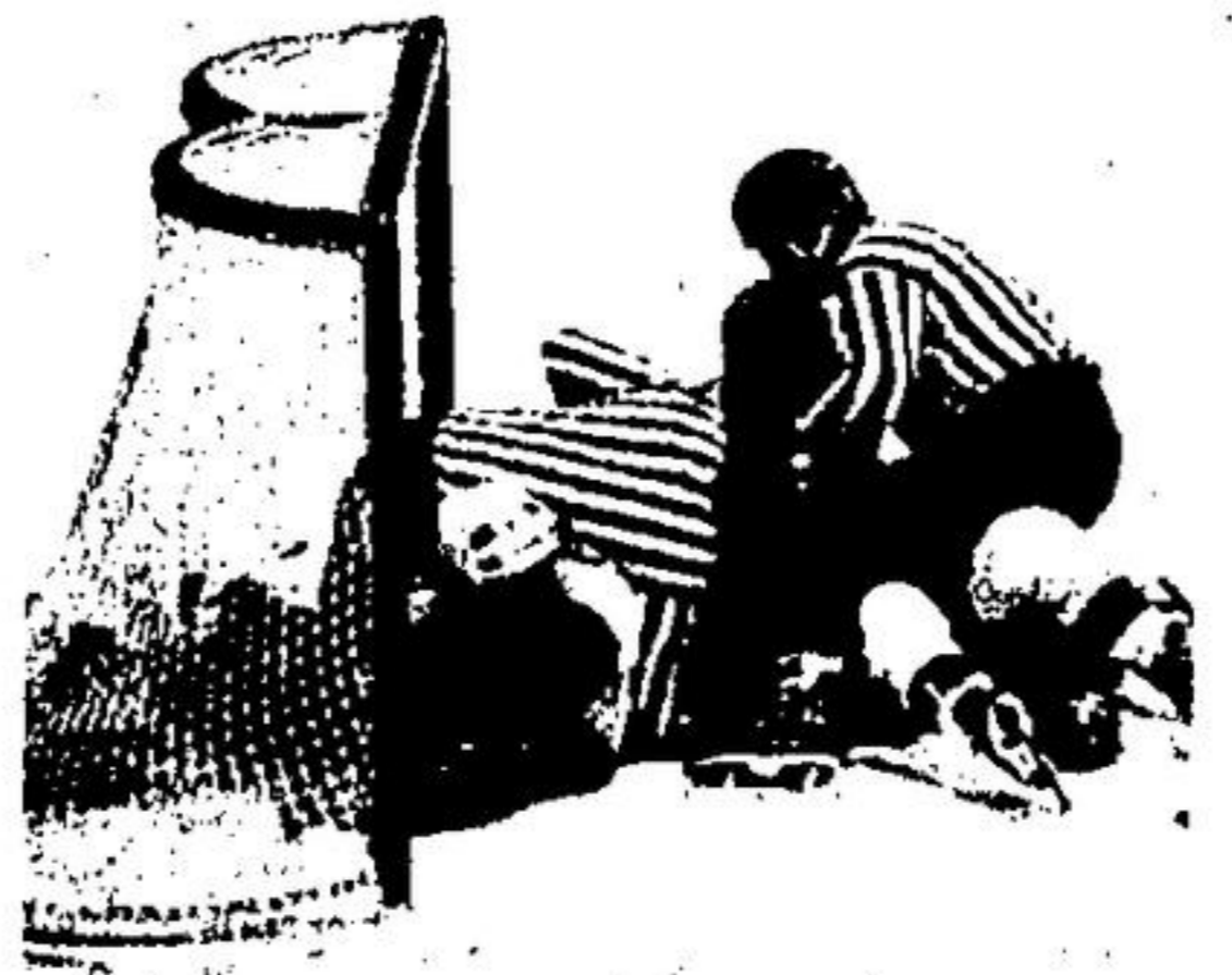
Sometimes the only way to stop a flight is to sit on the players, as these referees point out to an angry Raider and Fort Erie team member.