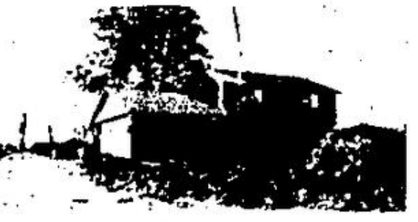
$99,900. COUNTRY ELEGANCE

Went to Charm School! A delight to the eyes and appealing to the family looking for an acre with a spectacular view from the escarpment. If you want to 'start living' inspect this charming 3 bedroom home. Elegant living room has fireplace, rustic kitchen with all appliances, wall units in den, drapes & sheers are included in the price - This exceptional home is located near 401 and close to Acton - Be sure to see it today.