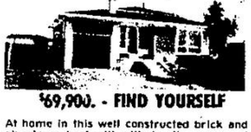
$69,900. - FIND YOURSELF

Surrounds this brick older home in Norval. Fireplace in living room, big old fashioned kitchen, 3 bedrooms, extra washroom and separate garage - Big old trees on large lot. This may be just what you're looking for - see it today.