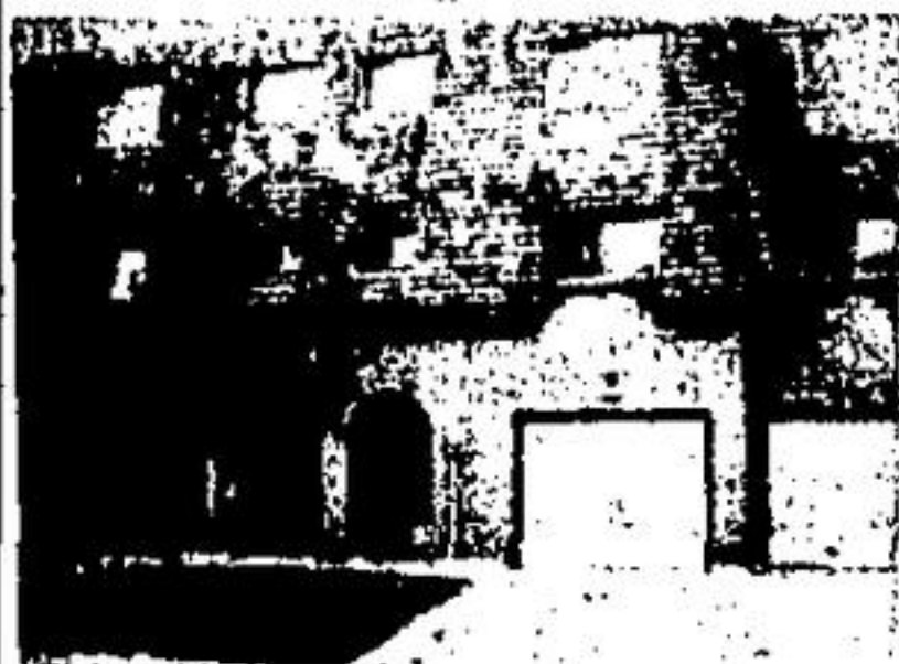
$39,900. - WHY RENT?

When you can BUY this Multi-level townhome in Bramalea for this low price! Features of this excellent home include 4 bedrooms, separate dining room, den, garage as well as frig, stove and broodroom! Excellent mortgage. See it today.