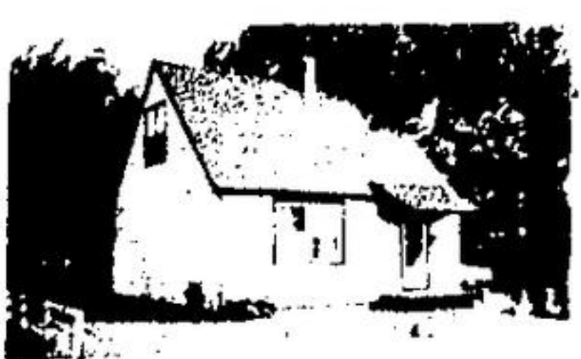
$46,900. - LOW DOWN PAYMENT

A Low Down Payment will get you this exceptional aluminum home in scenic Hillsburg. 'Party size' kitchen, family room with walkout to cedar deck, separate garage and lovely big lot - Good financing - Let us show you this one today.