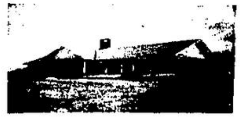
$245,000. THE ULTIMATE

-Eramosa - 60 acres workable and 40 acres bush with a very good barn and a Brand New 4 bedroom home offering main floor laundry room, 3 baths, finished basement with rec room and cold room, 2 car garage and tree lined driveway. Purchaser to have choice of broodroom & colours - Dial for Details.