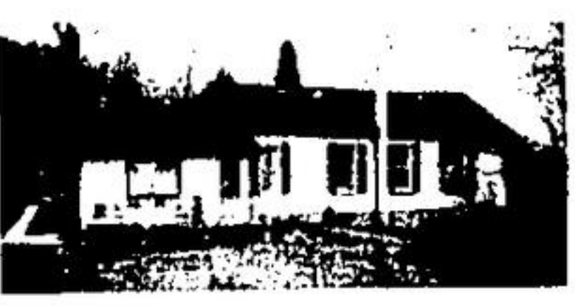
$99,500. - THIS HOME

Commuter's special near 401 and not far from Georgetown. This beautiful rancher is situated on a picturesque acre with inground pool, fireplace in elegant living room, nicely decorated kitchen, 3 bedrooms, walkout to patio from family room, ensuite bath off master, and double garage with pit. You'll Love it! Now only $89,900.