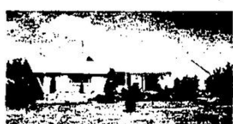
$79,900. SCHOOL BUS

From the raised deck off formal sized dining room, dream kitchen, cheery decor and great workshop for Dad. Other outstanding features include broodroom, 2 baths, 3 huge bedrooms with den or 4th bdrm, log burning fireplace in family room and walkout to fully fenced yard - lovely gardens and mature landscaping - An inspection is necessary to appreciate this fine home.