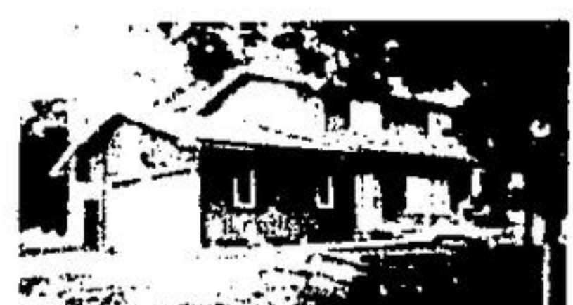
$189,900. EXCELLENT FARM

The panoramic view from the balcony of this stately stone home is breathtaking! If you're looking for a farm with a 1 acre pond plus spring fed pond, barn and a home with space this may be it!! 3 big bedrooms, large living & dining rooms, family room with fireplace, plenty of cupboards in country kitchen - Call for further information.