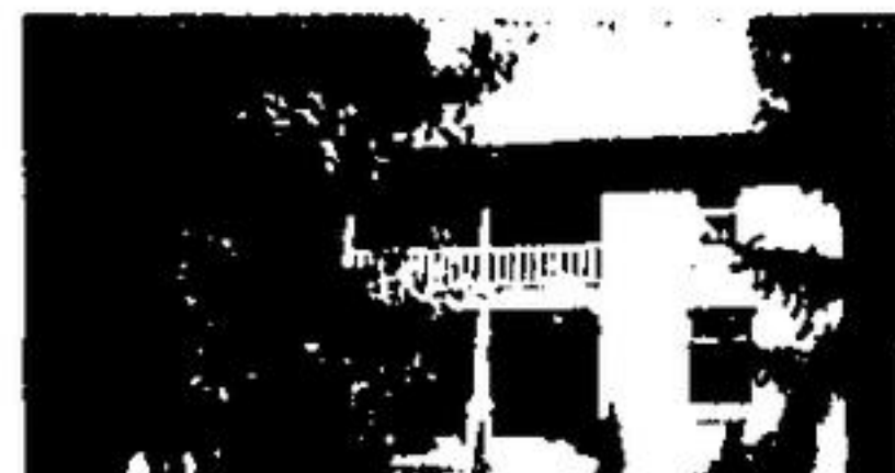
$79,900. - VERY SPECIAL

Stops at the door for the kids - This 4 bedroom rancher on nearly 4 acres just a few minutes from Georgetown's Go Station features ensuite bath, den or office, workshop, sewing room and double garage - Excellent Value if you want a Country Home at Town price!