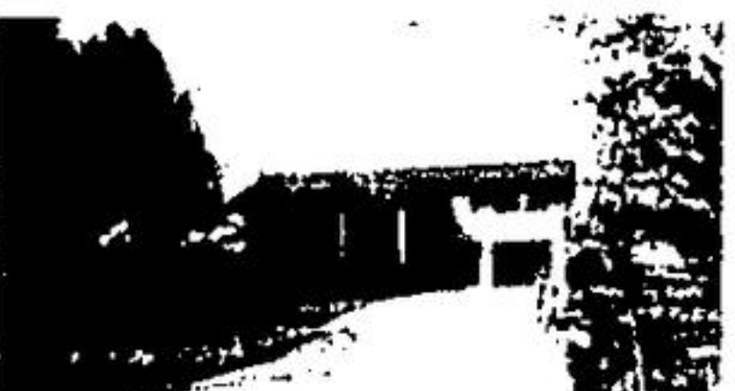
$105,000. LOVELY POND

Awaits the new owner of this new 4 bedroom brick & aluminum 2 story nearly completed. Walkouts from large breakfast nook and family room, main floor laundry room, ensuite bath to master bdrm., fireplace in spacious family room and double garage - Be the early buyer and get your choice of broodroom and colours - See this home today.