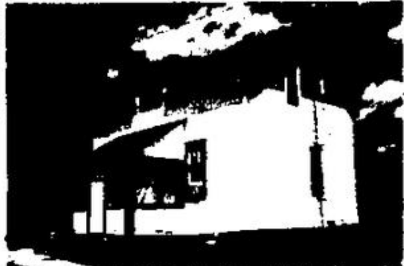
$44,500. - FALL SPECIAL

In this newly decorated 'Street' Townhome in Downtown Georgetown. Very spacious living and dining room, super kitchen with new cupboards, gorgeous brand new broodroom throughout - full basement - no maintenance fee - Real value!