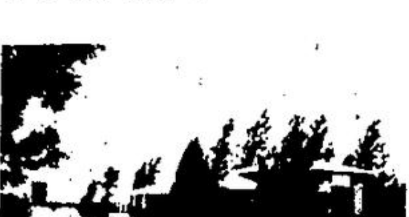
$109,900. FIVE ACRES

Enhances the serene setting - This '1 yr. new' raised bungalow on a gorgeous 2 acre treed lot, superbly landscaped features a 2 car 'plus' garage, 3 baths, fireplace in family room, 4 bedrooms, beautiful broodroom and elegant decor. Truly a nature lover's haven not far from town.