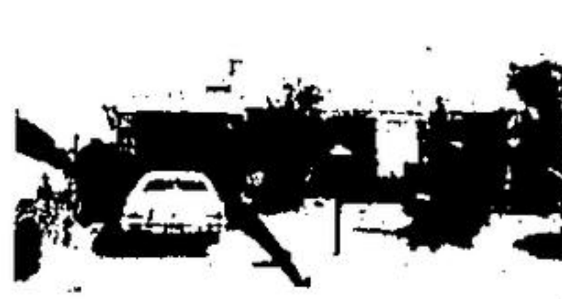
$85,900. - UNIQUE

You MUST SEE this elegant brand new raised bungalow on an acre with breathtaking view!! Superb broodroom, 4 large bedrooms, fireplace in large rec. room, laundry room, 2 baths. Fantastic kitchen with walkout to deck, smoke detector and garage - Make your appointment today.