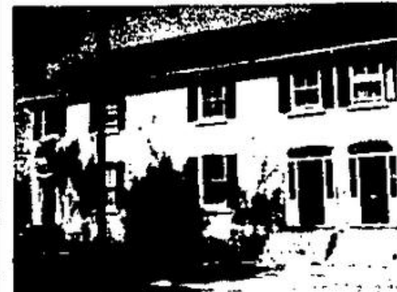
$43,900. BEAT THE RENT

When you can BUY this Multi-level townhome in Bramalea for this low price! Features of this excellent home include 4 bedrooms, separate dining room, den, garage as well as frig, stove and broodroom! Excellent mortgage. See it today.