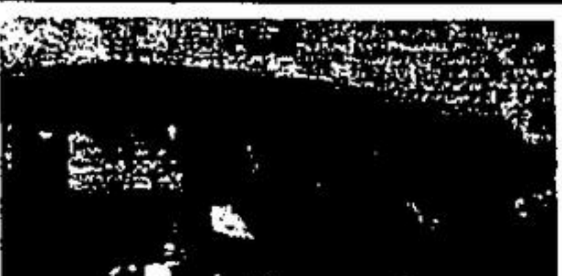
$89,900. - LOOKING FOR ACREAGE

Custom brick barbecue, heated inground pool, change room, outside lighting, superb landscaping with rare trees and shrubs on the outside and inside this exceptional backsplit the features include air conditioning with air cleaner, insulated wine cellar, gorgeous family room with fireplace, 23 ft. master bedroom and partially finished basement. An inspection is necessary to appreciate this fine home - Call today.