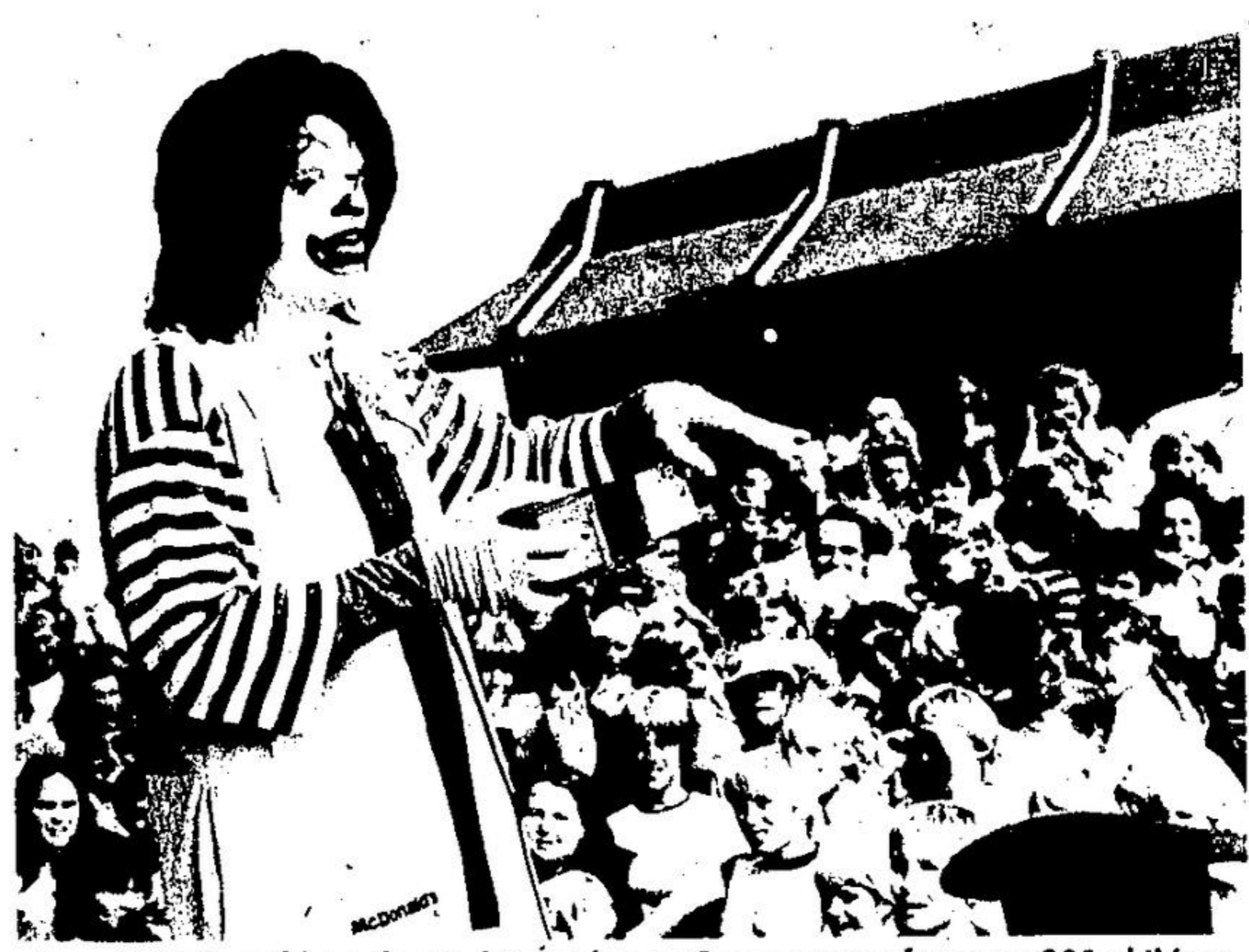
Ronald McDonald performed Saturday in Georgetown for over 200 children