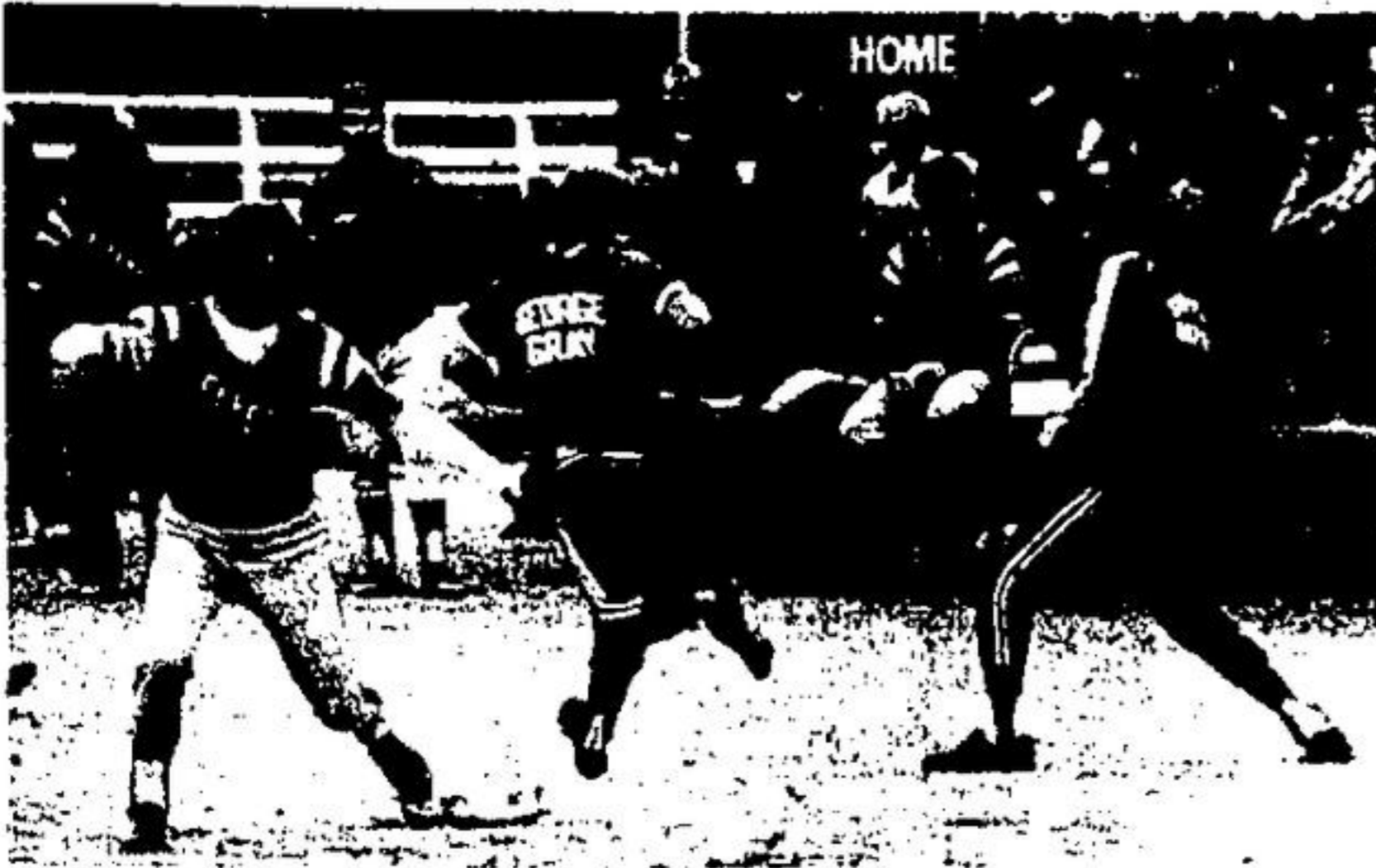
He's out at first! This Norval runner was just too slow for the Flyer's first baseman, as he gets tagged just before the base.