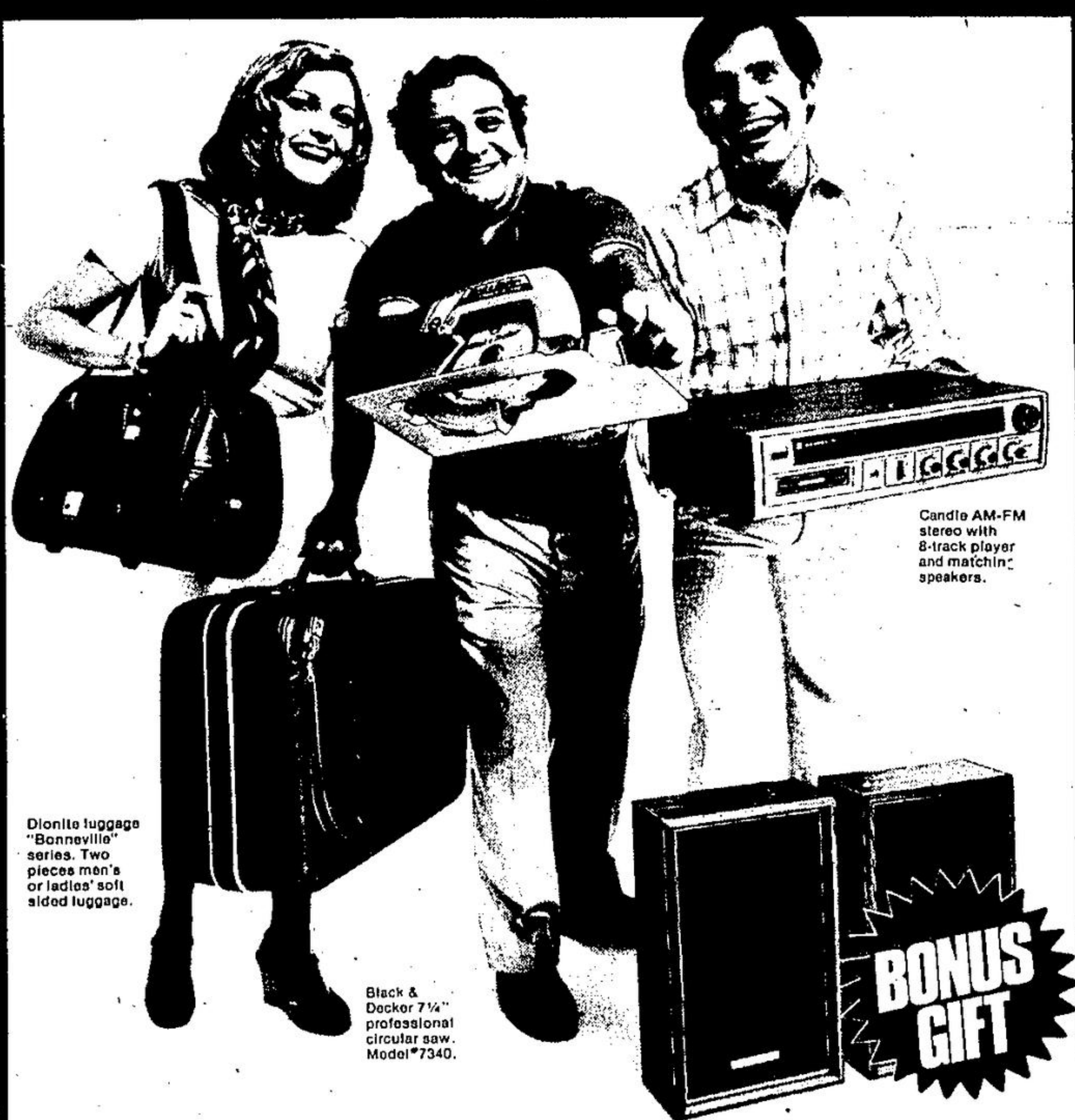
Dionite luggage "Bonnevillie" series. Two pieces men's or ladies' soft sided luggage.