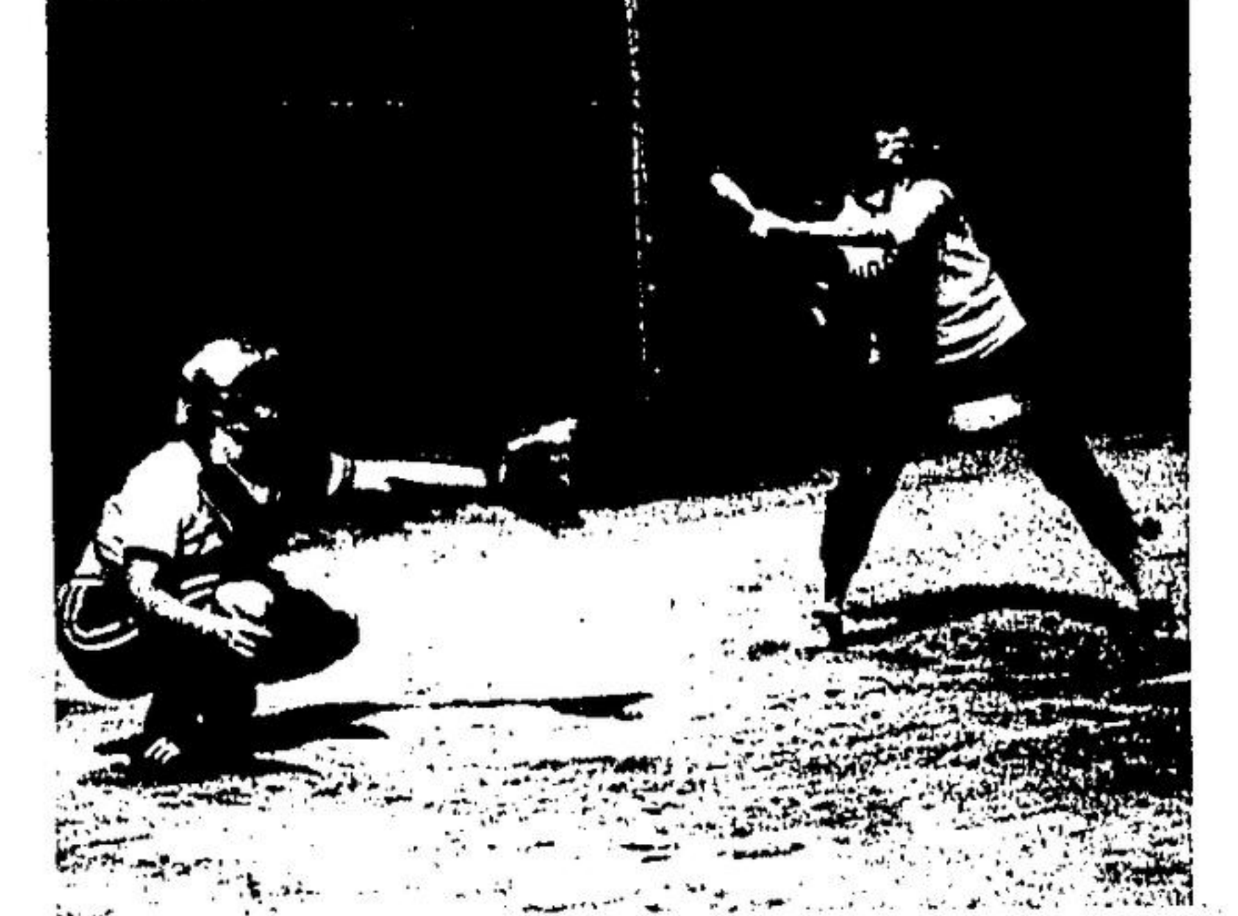
This Hornby batter is just a little late on the swing, but Hornby pulled up their socks and took over, beating the Georgettes 6-5.