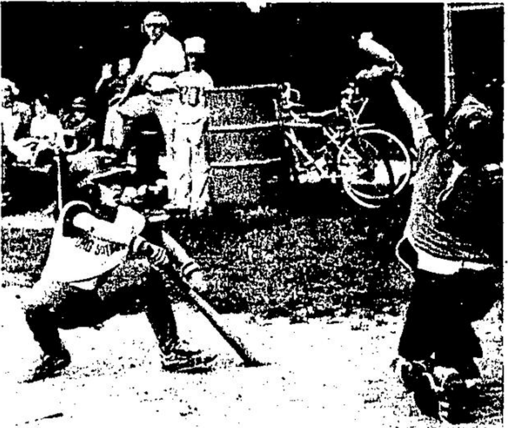
Ducking for safety, this Gage Stationary tyke was lucky to notice the wild pitch before it hit him.

Think about the foregoing proposals folks, because they could mean a curtailment in soccer unless there is a good response. Whether or not we remain in Ontario Soccer, the club system, is I believe, the best for the re-birth of the game.