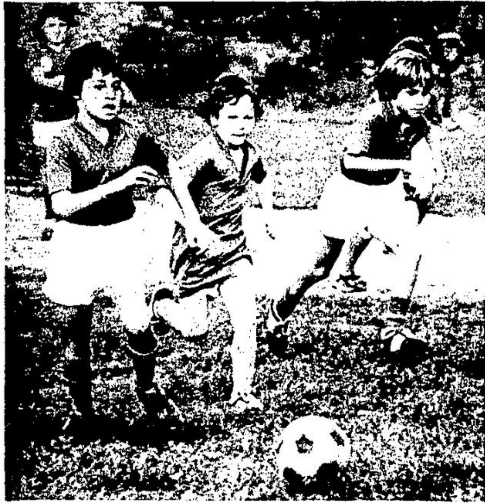
Racing for the ball is one of the key assets for any soccer player, and these Atom boys are learning fast.