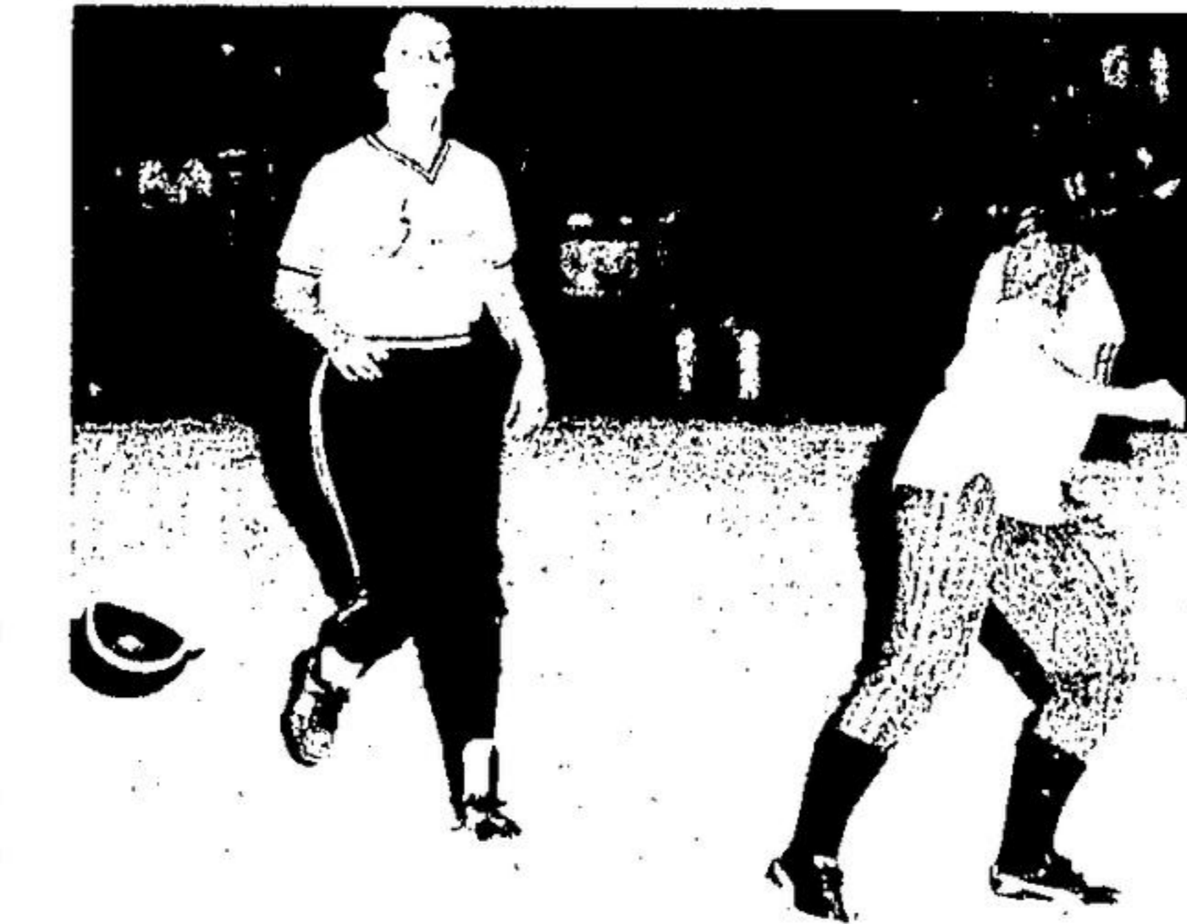
It was one run after the next as the Georgettes totalled Hornby 17-2.

Sandhill Shell and Gage Stationery will meet Monday, Aug. 8 at 8:30 p.m. on Diamond C.