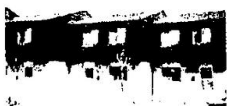
Starter Special - $41,500

On a quiet crescent featuring main floor family room, huge eat-in kitchen, plush broadloom, above ground pool and loaded with extras. Make your appointment today with Sandra. Asking $69,900.