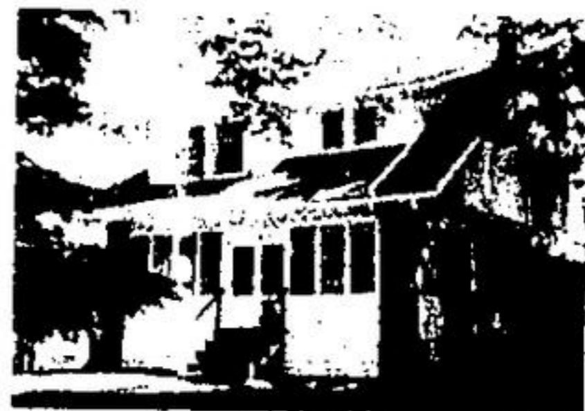
Spacious 2 Storey

This home sure has that beautiful large yard plus a great looking patio with gas Bar-B-Que. You should see inside - immaculate home-central air conditioning, 3 bedrooms, floor to ceiling fireplace in rec room. Be sure to see this home. Call Sandra.