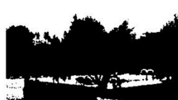
Fabulous Split-Level Home

Brand new and just loaded with quality; thermal pane windows, fireplace, sliding walk-out, cedar deck, and your choice of floor coverings. The high caliber is reflected throughout the five bedrooms living and dining rooms. Call Sandra.