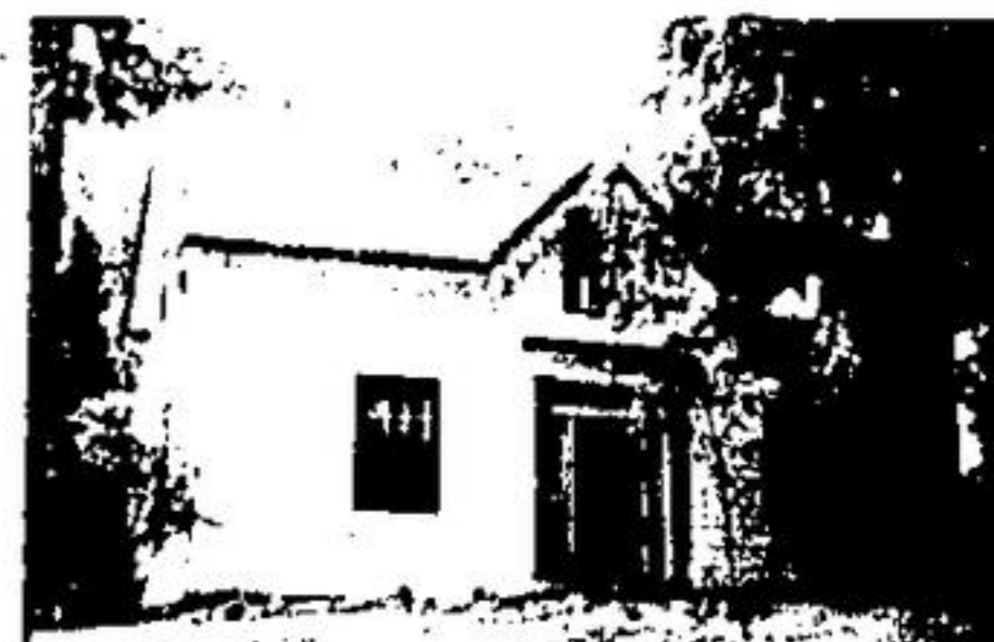
Beautiful Older Home in the Park

Living room and dining room, 3 bedrooms, beautifully landscaped lot, immaculate throughout, broadloom, single car garage, floor to ceiling fireplace, finished rec room and den professionally done. For appointment call Rozetta. $68,900.