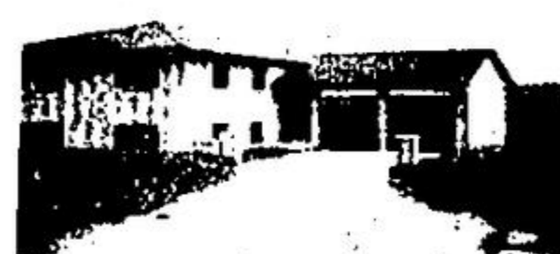
3,000 square feet - $86,900

Great for starting out - plenty of space, 3 bedrooms, living and dining room with walkout. Broadloom throughout, 4 appliances. Call Wendy to view.