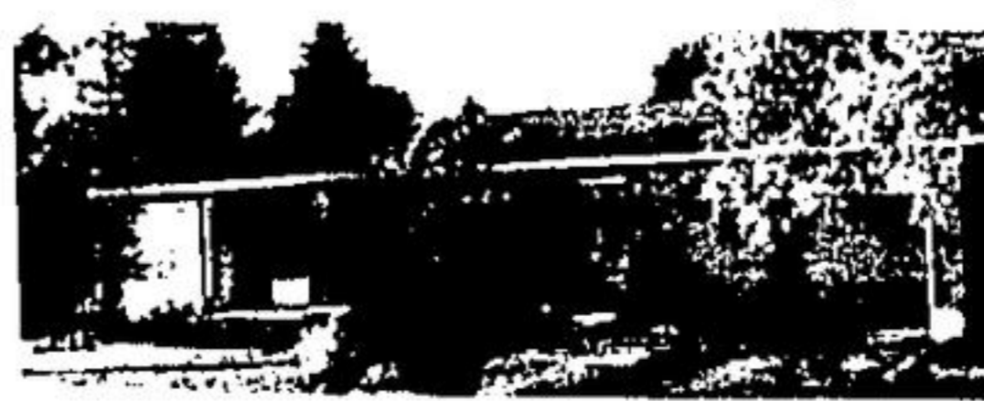
Retire or Get Started

In the park. Beautiful older home, large living room with fireplace, main floor family room with fireplace, large dining room, 4 large bedrooms, and a unique bathroom. It's worth looking into. Call Sandra to view.