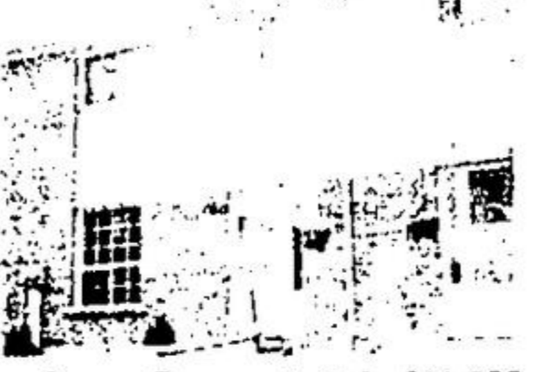
Low Down Payment Only $41,900

Large 4 bedroom semi-detached home with finished rec rooms and laundry room. The owner has added all kinds of extras. Broadloom throughout. The yard is just the right size with a 16'x24' pool. Next to the ski hill and skating rink, schools and shopping in walking area. Call John.