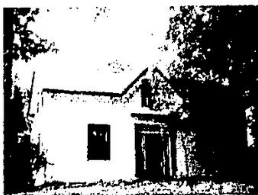
An Old Style Home On A New Style Street $74,500

On a quiet crescent featuring main floor family room, huge eat-in kitchen, broadloom, above ground pool and loaded with extras - Make your appointment today with Sandra. Asking $69,900.