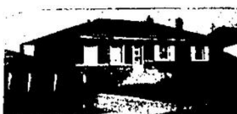
58 MCINTYRE CRESCENT

With good financing available, three bedroom townhome, conveniently located, walkout from living room, 4 appliances. Call Wendy for more details.