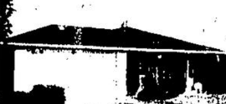
$79,900. AVON CHARMER

Sparkling clean 3 bedroom home, plush broadloom in living and dining rooms; tastefully finished family room with sliding walk-out; four appliances. Mature trees shade the back yard - see for yourself. One of the finest condominium concepts in the area. Call Sandra to view.