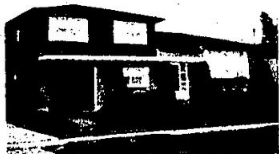
Look At This Beauty

On a quiet crescent featuring main floor family room, huge eat-in kitchen, broadloom, above ground pool and loaded with extras - Make your appointment today with Sandra. Asking $69,900.