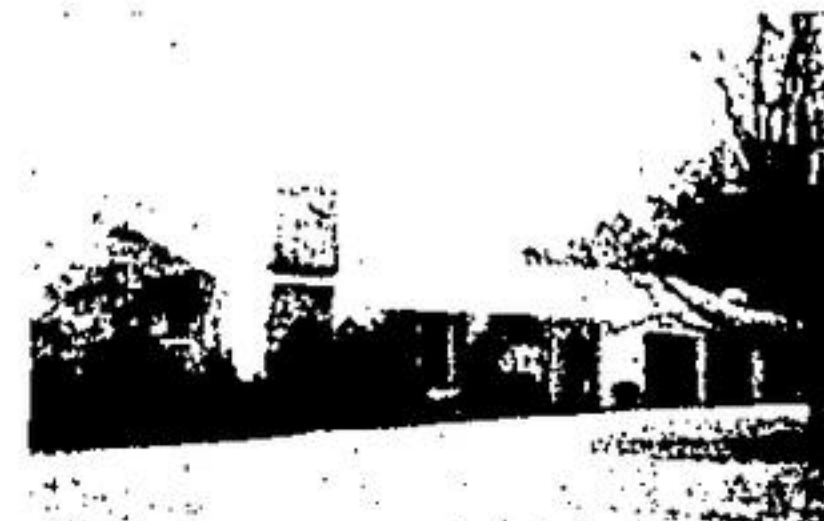
A VIEW FOR ALL SEASONS

Just come and look; you won't be able to resist this charmer with it's 4 bedrooms, big dining room and gingerbread trim. Small down payment will move you in. See it with Sandra today.