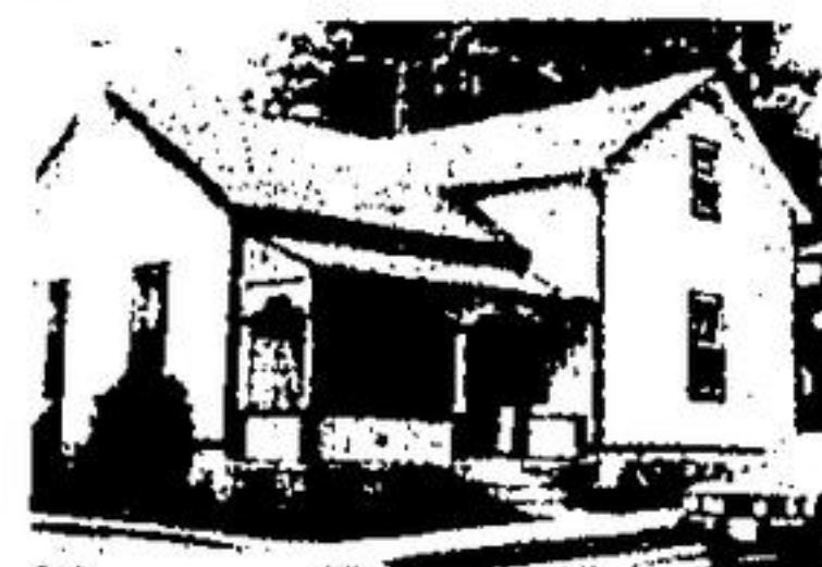
Acton Sweetheart - $46,900

That's right and it's located right in the Park area. You'll love this home - formal dining room and living room with fireplace, large country style kitchen, main floor family room, 2 bathrooms, 3 bedrooms and there's more. Interested? Call Rozella.