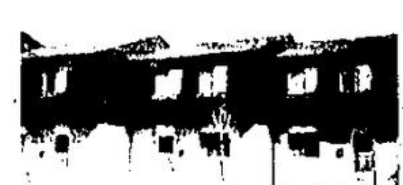
$41,500 DEAL? YES! $5,000. DOWN

On quiet cul-de-sac is the setting for this immaculate 3 bedroom raised bungalow. This beautiful home features large living room and dining room, superb rec room with floor to ceiling fireplace, plus a study, broadloom and much more. For further details call Sandra today.