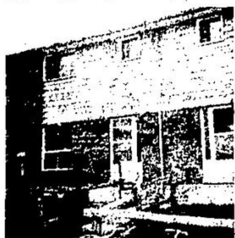
Value Plus - Only $41,900 -

Your plants deserve a home like this - windows galore. Open concept, 1728 square feet, quality kitchen cupboards, 3 bedrooms with extra large master, two fireplaces. For more details call Rozella.