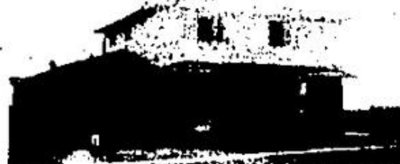
A Feeling of Space

Four bedrooms, main floor family room with walkout to covered patio, large lot, and convenient to schools and shopping. At this price you better hurry. Ask for Sandra.