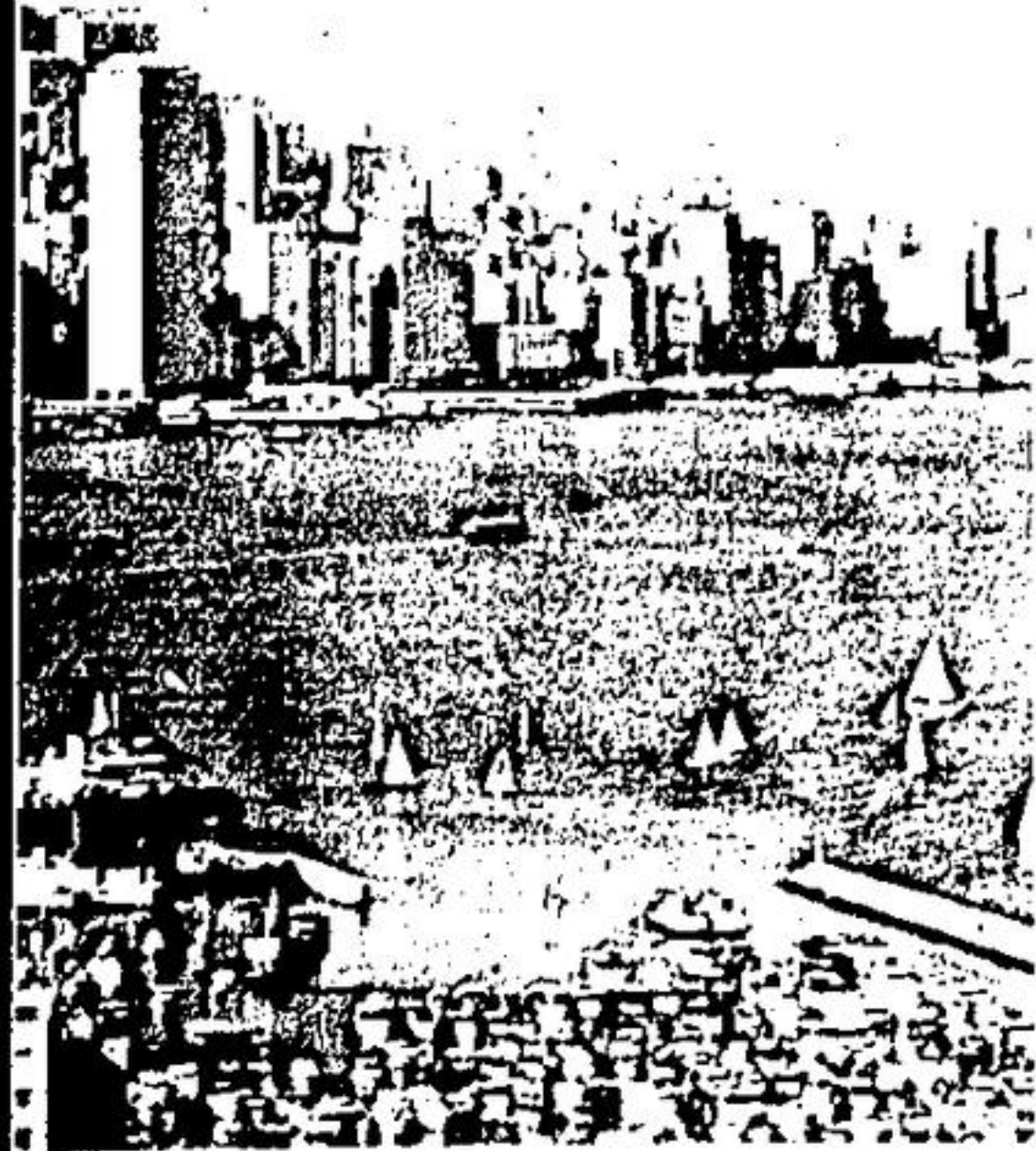
Busy and Beautiful Hong Kong harbor

American Express presents the greatest travel bargain ever offered to